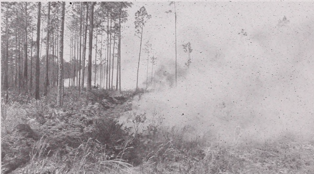
Prescribed burning is an ecosystem management tool used by the Forest Service in the regeneration of plant life. Fire exposes soil, thereby allowing seedlings to settle in the earth.

Prescribed fire in the growing season is another area of focus. A successful prescribed-fire regime mimics naturally occurring fires. In Florida, that means increasing the numbers of fires in the growing season. These burns are vital to the health of longleaf pine/wiregrass and associated ecosystems. Until recently, we did little growing-season prescribed burning. However, with the encouragement of many forest owners, the grow-