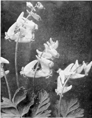
Dicentra (Dutchman's-breeches) (See page 3)