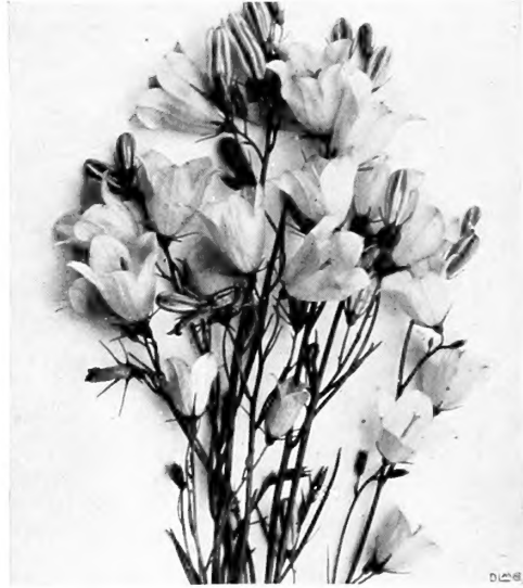
Campanula rotundifolia (Bluebells)