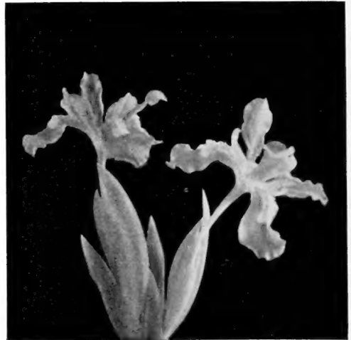
Iris cristata (Crested Iris)