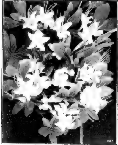
Azalea viscosa (White Swamp Pink)