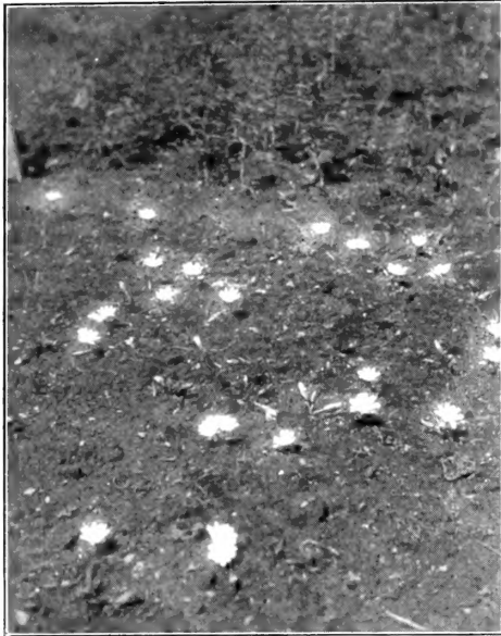
Lewisia rediviva (Bitterroot)