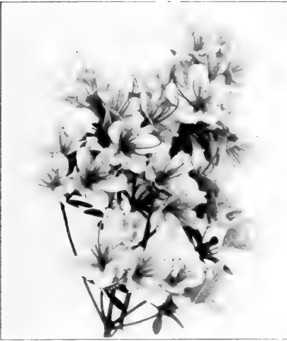
Azalea vaseyi (Pinkshell Azalea)