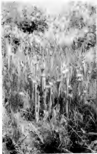
Sarracenia flava (Trumpet Pitcherplant)