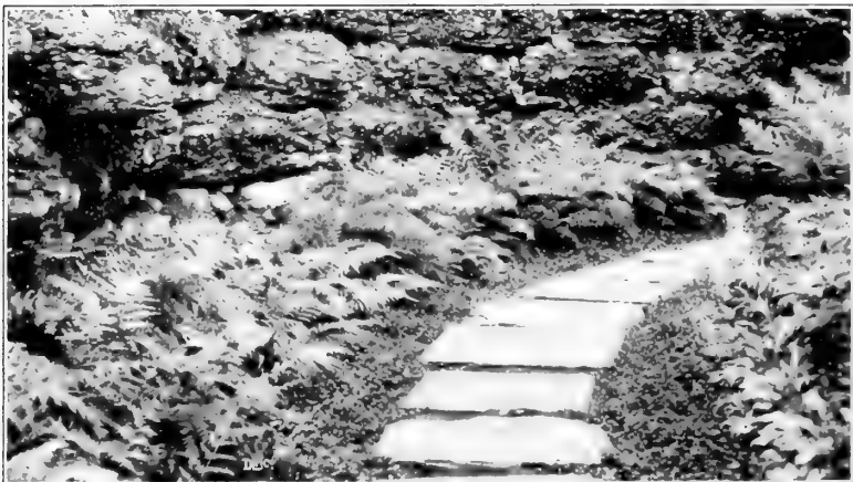
Hardy Ferns in the Rockery

This price list is for Fall, 1929 only and does not apply to orders for Spring, 1930