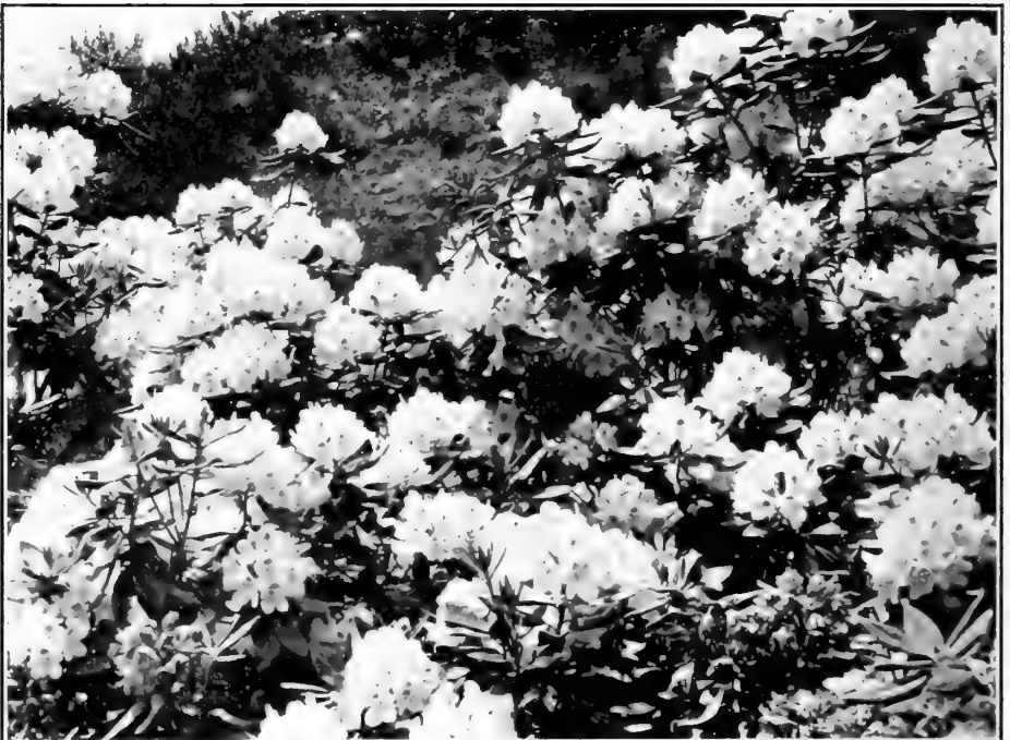
Mass Planting of Rhododendron maximum

Note —Except as noted, the above prices apply to nursery grown plants. If you are interested in buying carlots of native collected plants for extensive naturalistic planting we will gladly quote on your requirements.