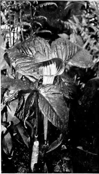
Arisaema (Jack-in-the-Pulbit) (See page 1)