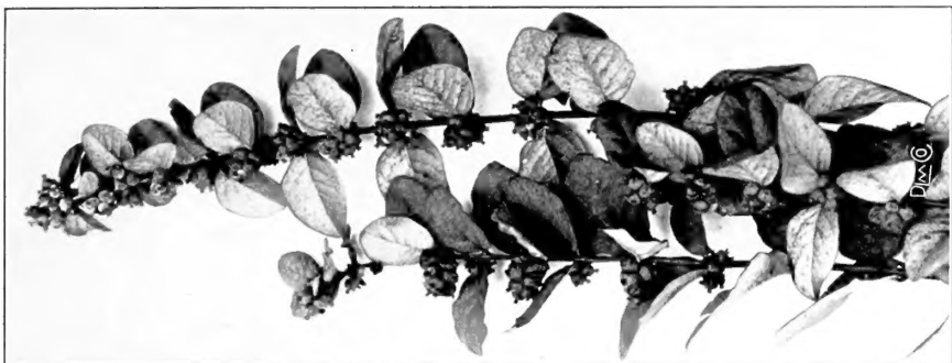
Symphoricarpos vulgaris (Indian Currant)

RUBUS odoratus (Purple Flowering Raspberry). A native shrub, particularly adapted to moist shade. From Midsummer till Autumn, the single, rosy-purple flowers nearly 2 in. across, are borne freely. The large red berries are edible and usually enjoyed by the younger members of the family. Large leaves, several inches across. Bush grows 4 to 6 ft. tall. 3 to 4 ft. plants, 40c. each, $3.00 per 10.