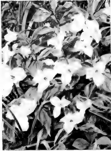
Trillium grandiflorum (chaste white)