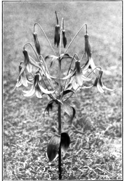
Lilium Canadense (Meadow Lily)