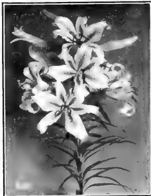
Lilium auratum (Goldband Lily)

Lilium elegans, var. Orange (Orange Cup Lily). Dwarf variety. 35c. each, $3.50 per doz. Lilium elegans, var. atrosanguineum . Flowers a deep crimson. 35c. each, $3.50 per doz. Lilium elegans Mixed . 25c. each, $2.50 per doz. Lilium grayi (Grays Lily). See Wildflowers. Lilium henryi . Very hardy, easily grown; a real orange color. 75c. each, $7.50 per doz. Lilium philadelphicum (Wood Lily). See Wildflowers. Lilium platyphyllum . Practically the only unspotted auratum. Bulbs from our own field. 50c. each, $5.00 per doz. Lilium regale (Royal Lily). One of the hardiest Lilies and very well known. 50c. each, $5.00 per doz. Lilium speciosum rubrum (Pink Show Lily). We have a few hundred from our own fields. 50c. each, $5.00 per doz. Lilium superbum (Turkscap Lily). See native variety. Lilium tigrinum (Tiger Lily). Old-fashioned Tiger Lily. Good for naturalizing. 25c. each, $2.00 per doz., $18.00 per 100. Lilium tigrinum fl. pl. Unique, double form of old-fashioned Tiger Lily. 35c. each, $3.50 per doz. Lilium tenuifolium (Siberian Coral Lily). Small scarlet Lily, good for rock gardens. 35c. each, $3.50 per doz.