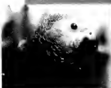
African Grey Parrot a threatened species