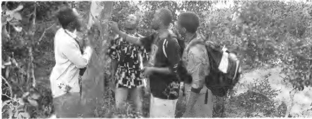
Members of the Dakatcha Woodland Conservation Group carrying out biodiversity monitoring at the Dakatcha Woodland Key Biodiversity Area (KBA).