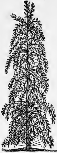
Representation of Quenouille training.

We are further informed that under such management Quenouilles require but little room, a square of four feet each way being deemed sufficient; their fruit being within reach may be easily thinned to enlarge its size; it is more secure against high winds; and being near the ground, the additional warmth it receives, materially insures its ripening in perfection.