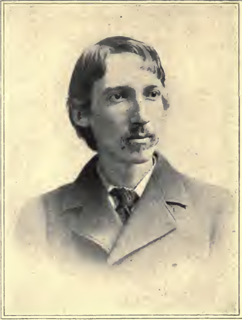
ROBERT LOUIS STEVENSON

From a portrait taken at San Francisco in 1879.