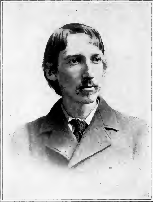
ROBERT LOUIS STEVENSON

From a portrait taken at San Francisco in 1879. Copyright by Charles Scribner's Sons.