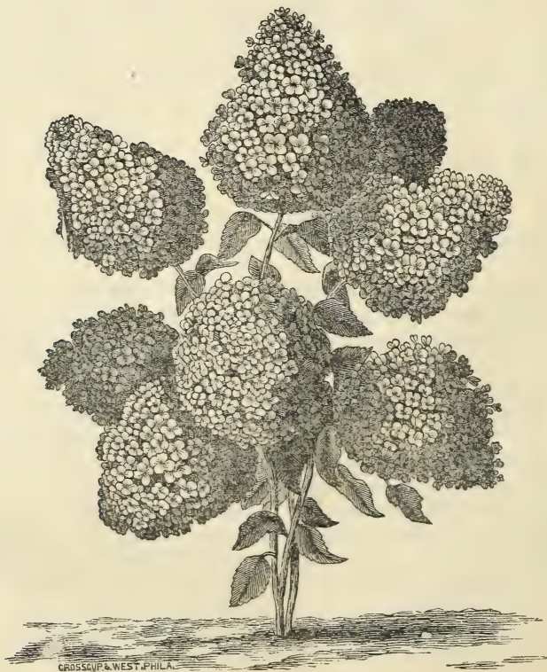
HYDRANGEA GRANDIFLORA. (See page 31.)