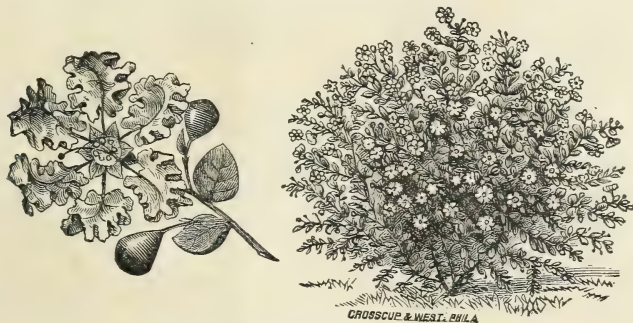
CRAPE MYRTLE. —(See page 38.)

Daphne Cneorum. —To those who are acquainted with this beautiful plant no recommendation is necessary. It is one of the choicest hardy border plants—low spreading growth; fine deep green leaves with pretty trusses of very fragrant rose colored flowers, which are borne in profusion from April to October—hardy in this latitude. 50 cents each.