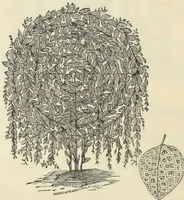
GOLDEN HONEYSUCKLE. — On Circular Trellis.