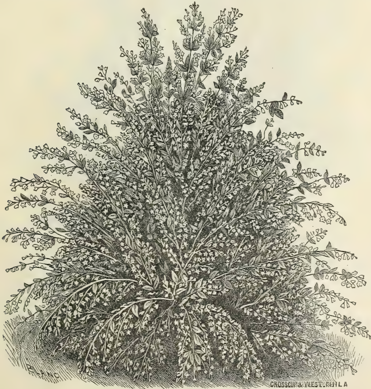
DEUTZIA GRACILIS. —(See page 32.)

The following named are among the finest varieties of Hardy Ornamental Flowering Shrubs , they are strong, robust growers, thriving in all ordinary