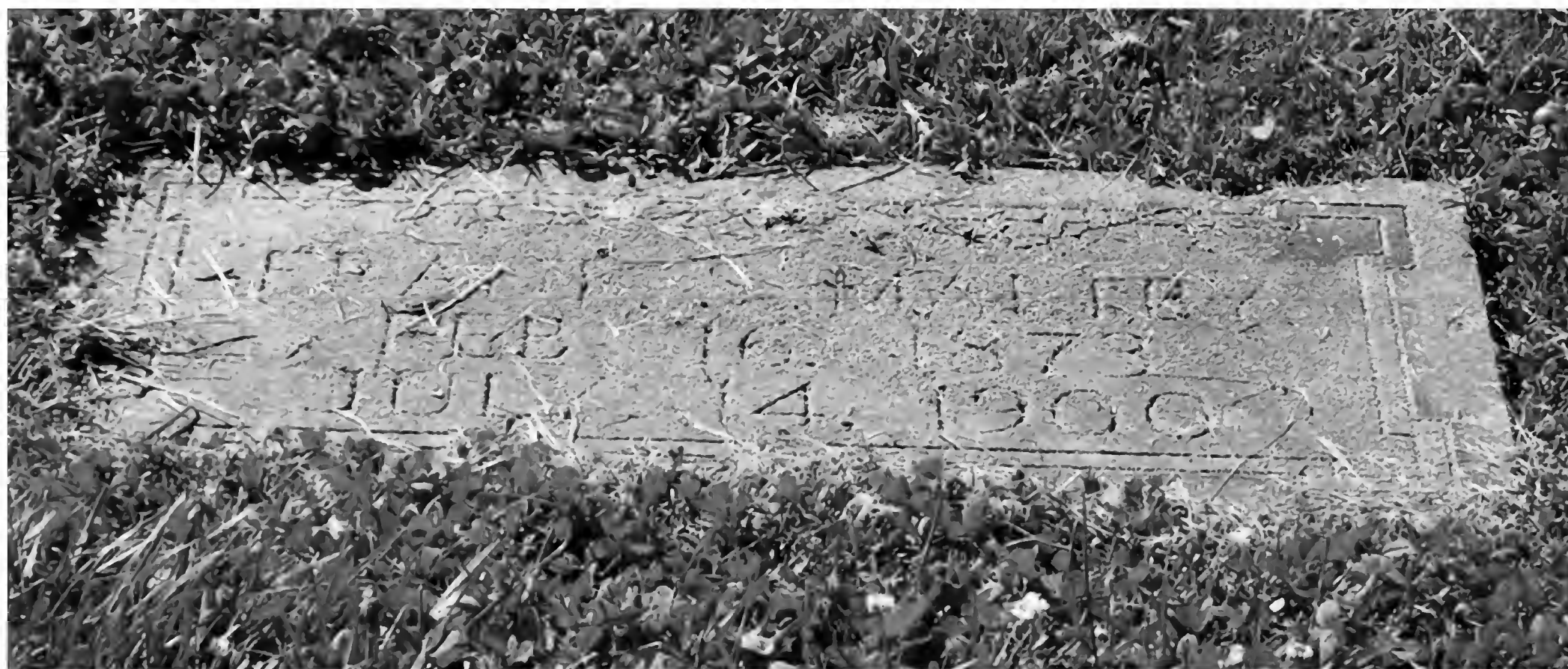
Gravestone, River View Cemetery, Aurora, Indiana. Inscription: Frank S. Maltby, Feb 16, 1873; July 14, 1900.