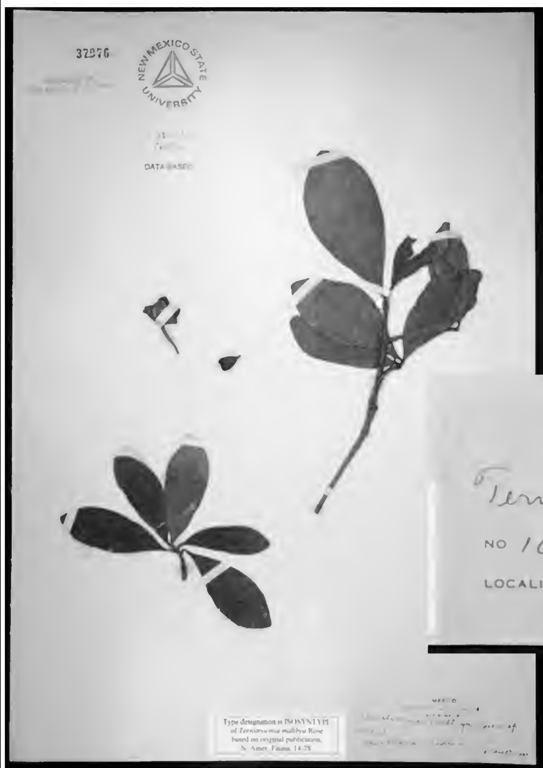
Specimen sheet and close-up of label of type collection of Ternstroemia maltbyi (NMC), incorrectly attributing the collection to "T.S." Maltby.