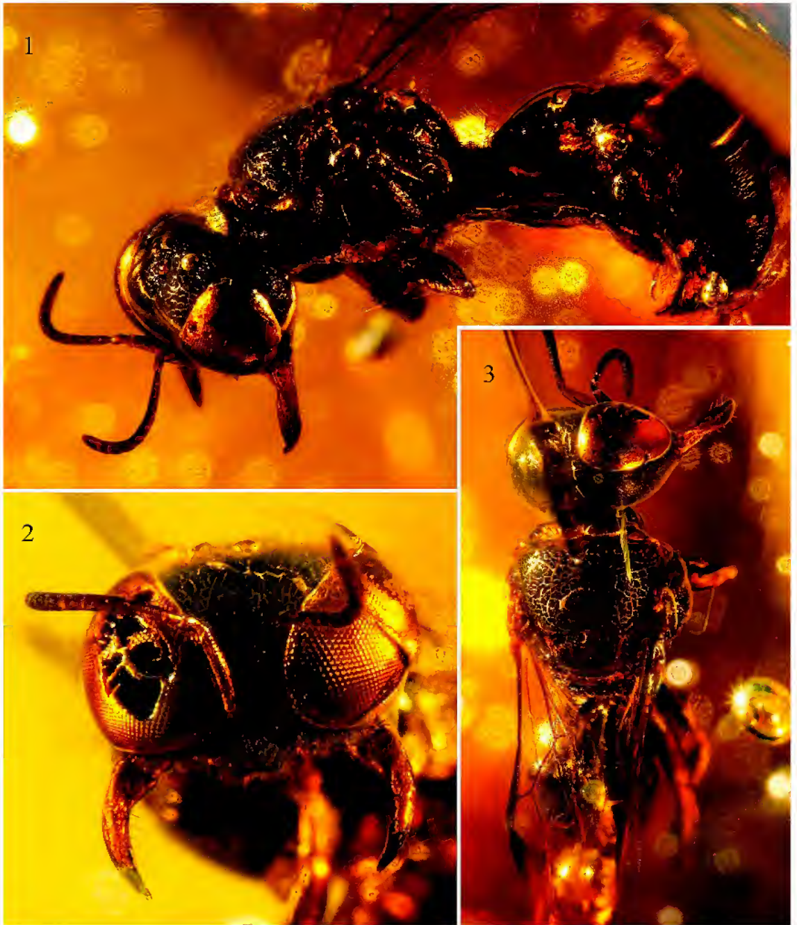
Figs. 1–3. Photomicrographs of holotype female of Lidenius paleomystax , new species (AMNH DR-14-1091). 1. Oblique lateral habitus. 2. Facial aspect. 3. Dorsal aspect.