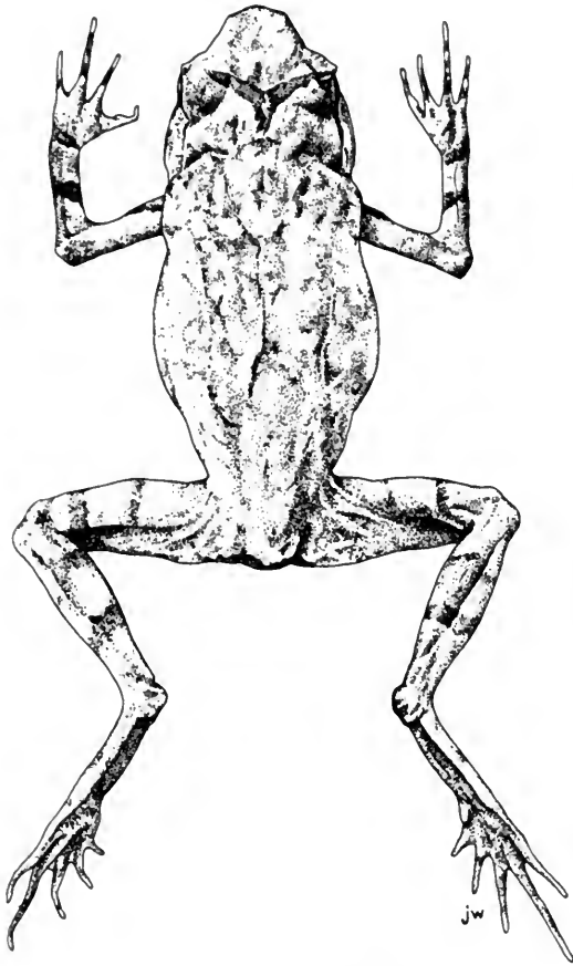
FIG. 101. Dorsal view of adult female Megophrys brachykolos ; snout-vent 43.5 mm.

The proportions of head length, head width, and tympanum diameter to snout-vent are smaller in females than in males. Head length in four females is 0.330–0.349, in ten males 0.354–0.395; head width of females 0.354–0.365, of males 0.373–0.430; tympanum diameter of females 0.062–0.073 (median 0.068), of males 0.065–0.086 (median 0.080).