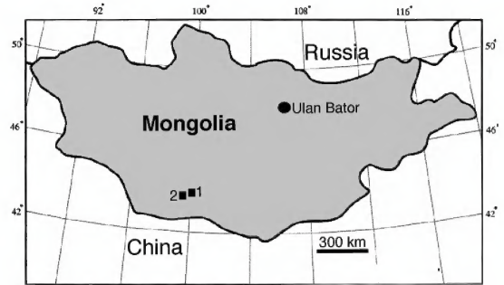
Fig. 1. Map showing the Mongolian Late Cretaceous localities of Gurilyn Tsav (1), where PIN 4499-1 was found, and Bugeen Tsav (2). Both have been dated Campanian to Early Maastrichtian in age (see text for details).

STRATIGRAPHIC AND GEOGRAPHIC DISTRIBUTION: Members of Presbyornithidae are known from the Upper Cretaceous of Mon-