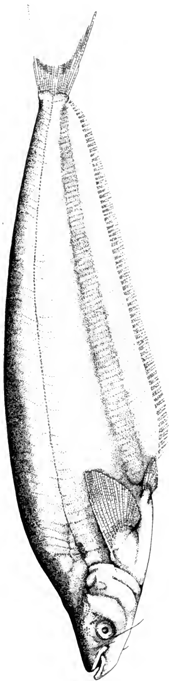
FIG. 46. Kryptopterus paranalis , new species; slightly reduced.