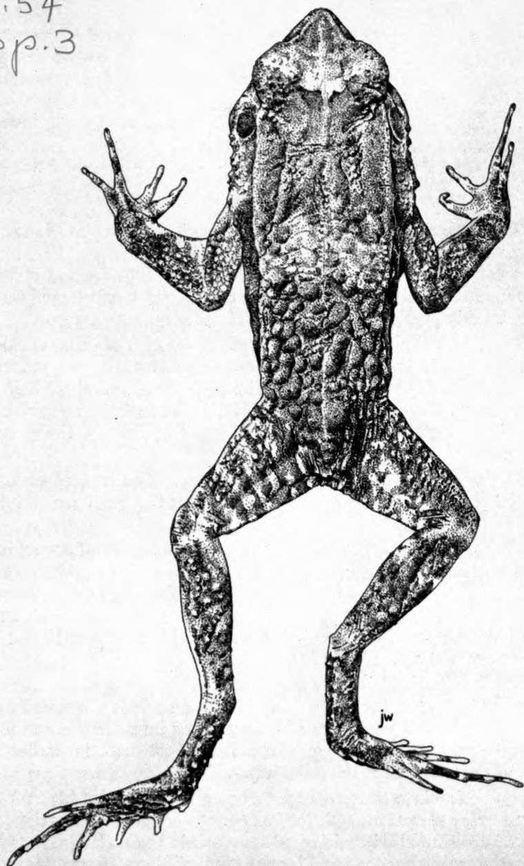
FIG. 106. Dorsal view of holotype of Bufo cristiglans , new sp. ( \times 1\frac{1}{2} ).