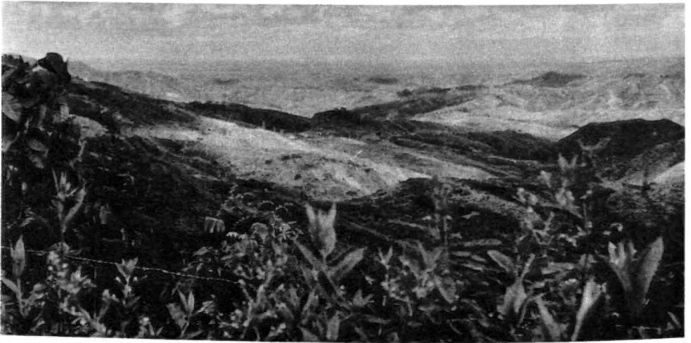
FIG. 2. Eroded hills near Mondomo, Cauca, Colombia. Observed habitat of Cypseloides lemosi .

The other species of Cypseloides differ from C. lemosi in size as well as in color pattern and structure. Cypseloides senex is a large, unicolorous form with stiff, not emarginate tail. The very rare C. cherriei is smaller also, with a stiff, not emarginate tail, and with a white spot in front of each orbit. Cypseloides rutilus is smaller, has an emarginate but stiff tail, a rufous chestnut collar and chest in adults, and differs from other Cypse-