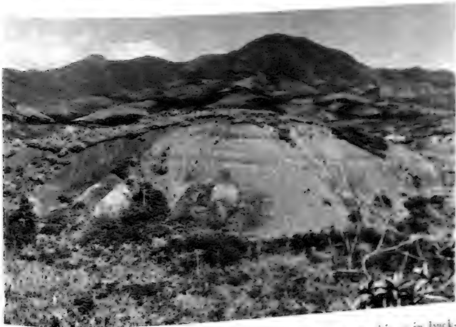
FIG. 3. Vicinity of Santander, Cauca, Colombia (Cerro Munchique in background). Observed habitat of Cypseloides lemasi .

Except for the flock near Santander from which the April specimens were taken, which was flying above pastures in flat country, all other examples seen or collected were in hilly or rolling eroded areas (figs. 2, 3), where the bare red soil is sparsely covered with a coarse grass para .