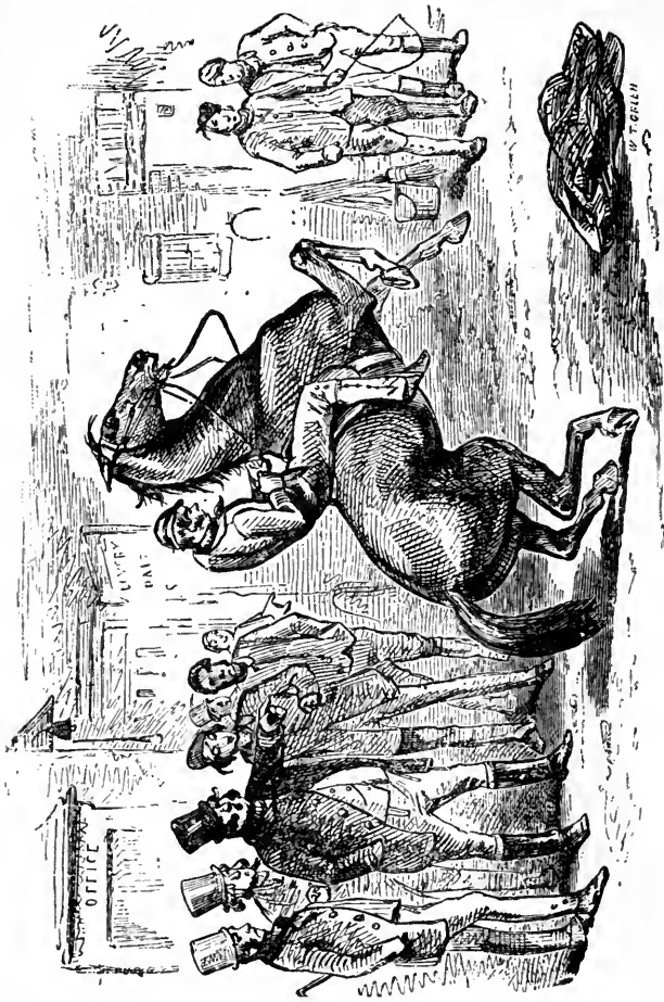
NIGHT AND MORNING.