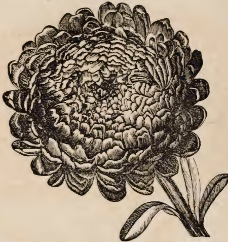
French Pæony Perfection Aster. —One-half natural size.

This splendid class of plants is not only one of the most popular, but also one of the most effective of our garden favorites, producing in profusion, flowers in which richness and variety of color is combined with the most perfect and beautiful form; it is indispensable in every garden or pleasure ground where an autumnal display is desired. In our flower beds and mixed borders it occupies a deservedly prominent position, whilst for grouping or ribboning it stands unrivaled.