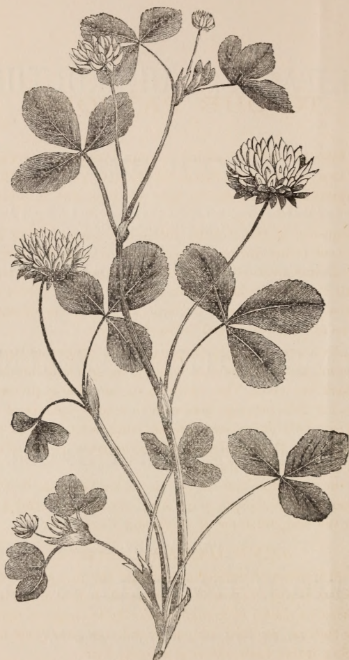
Alsike, or Swedish Clover.