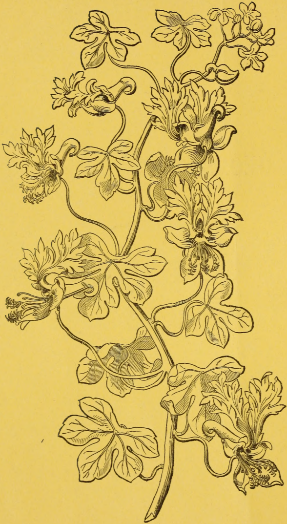
CANARY BIRD FLOWER.