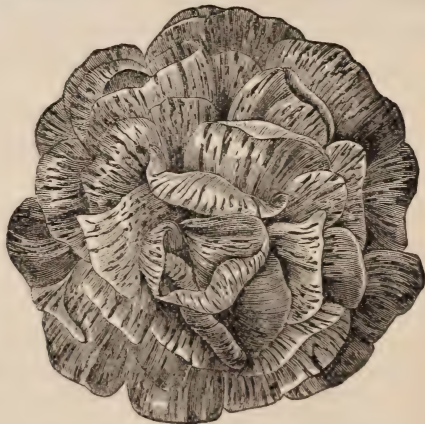
Double Dwarf Balsam. —Half natural size.