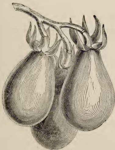
Pear Shaped Tomato.

Good for Five to Ten Years. —Beet, Cucumber, Melon, Pumpkin, Squash, Tomato.