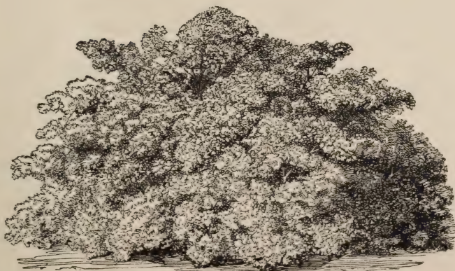
Moss Curled Parsley.