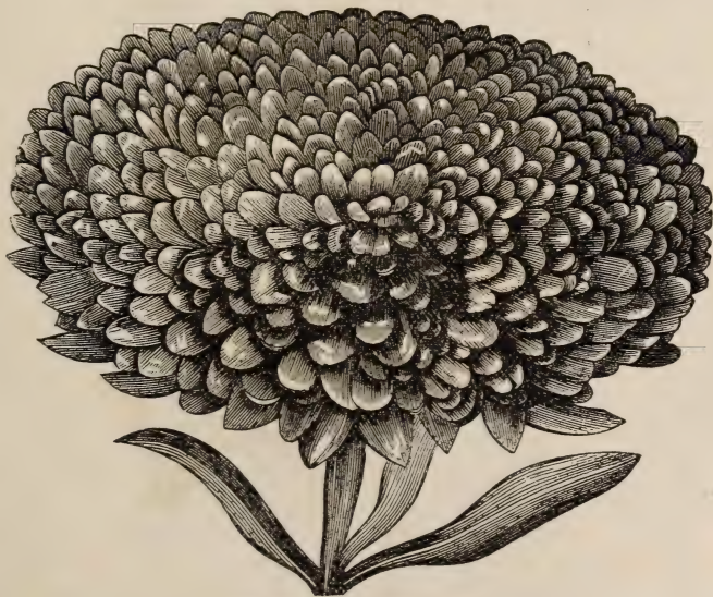
The Giant Emperor Aster.