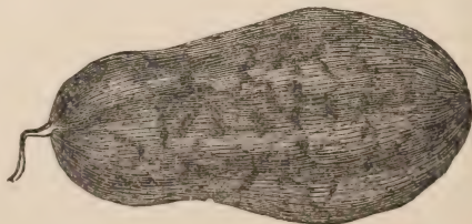
Mountain Sprout Water Melon.