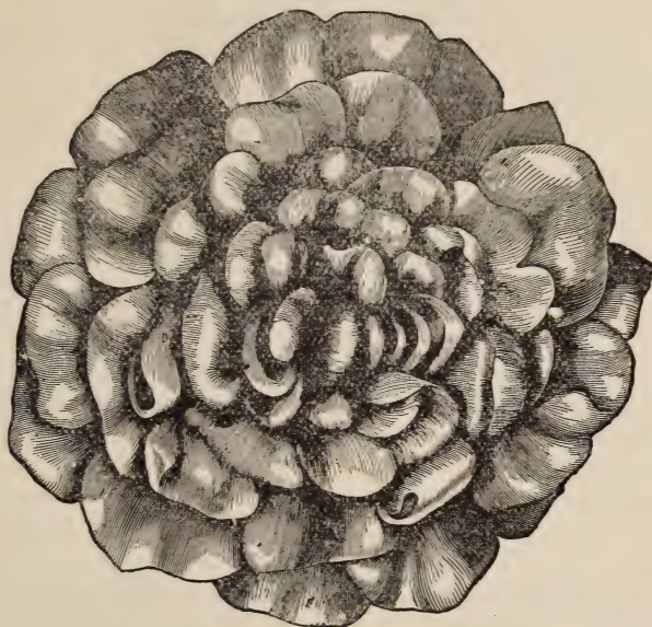
Rose Balsam. —Natural size.