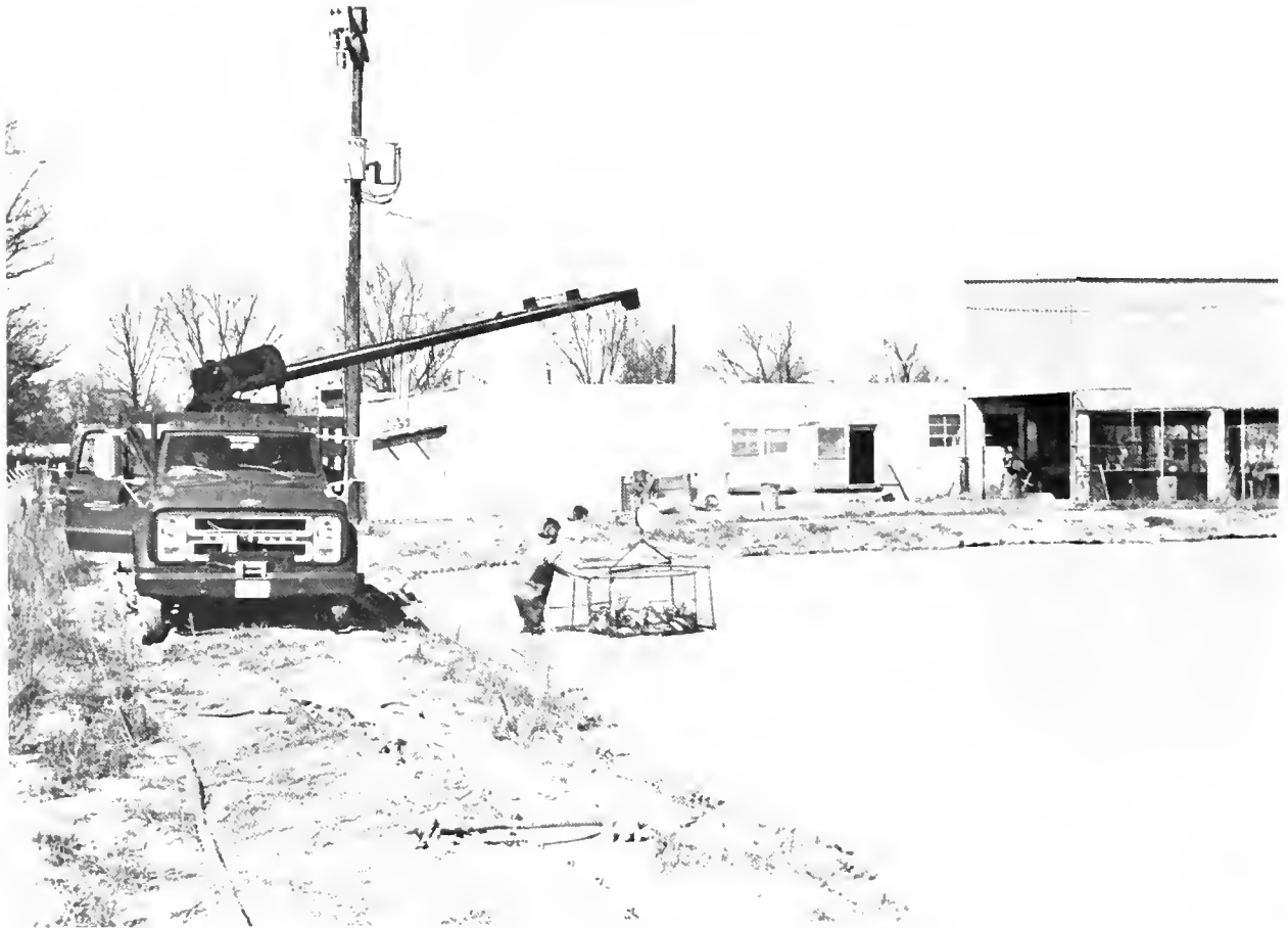
Figure 1.—Weighing container of channel catfish held in pond to determine weight change.

Test "A" consisted of measuring weight changes in four pots: the first two contained 90.7 kg (200.0 lb.) of channel catfish each, and the second two, 181.4 kg (400.0 lb.) of fish each. Fish densities were 320.3 kg (20.0 lb.) and 640.6 kg (40.0 lb.) per cubic meter (cu ft) of water. These pots were set in line near the