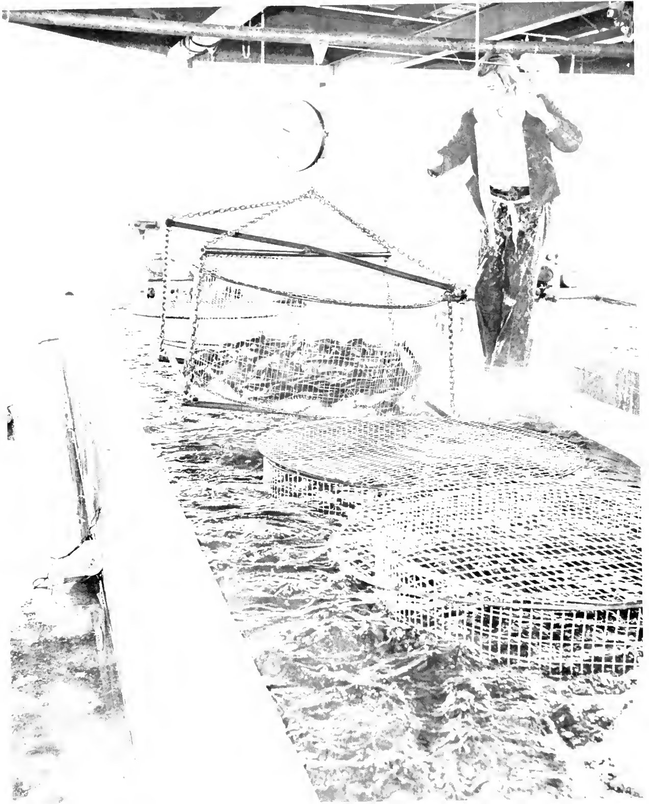
Figure 2.—Weighing container of channel catfish held in vats to determine weight change.