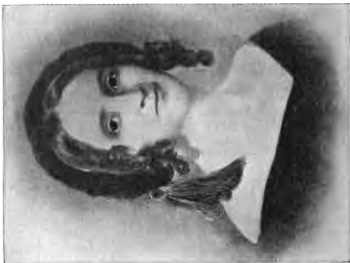
Mrs. James Knox Polk