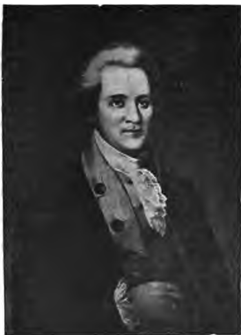
Governor John Sevier