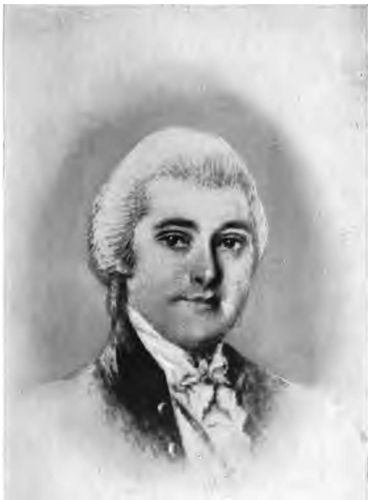
Governor William Blount Tennessee's Only Territorial Governor