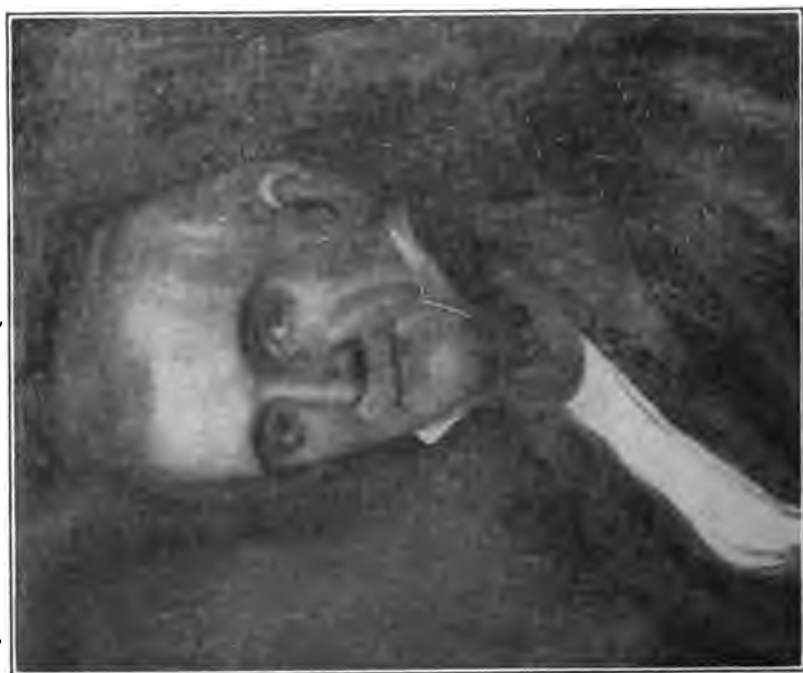
Governor James Knox Polk