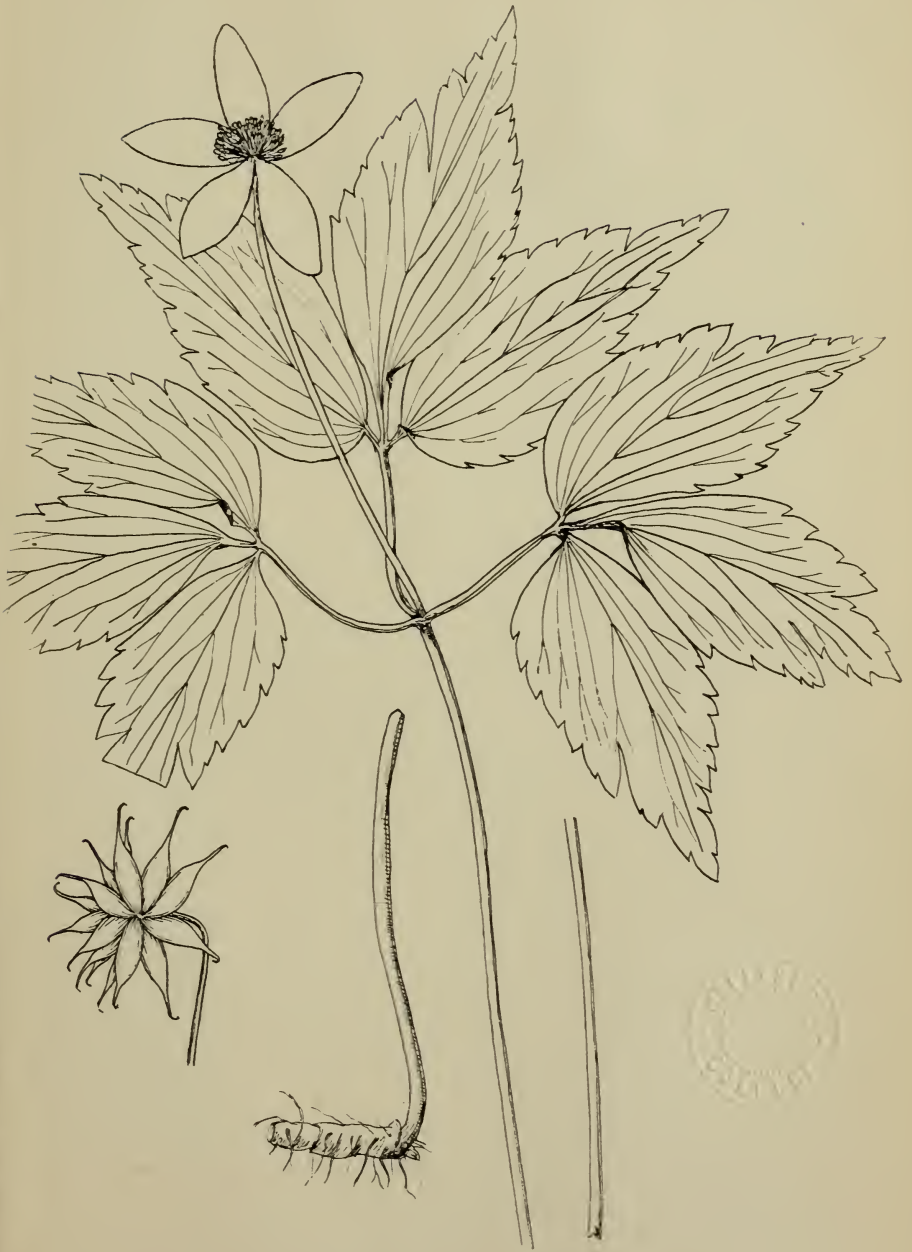
ANEMONE TRIFOLIA, L.