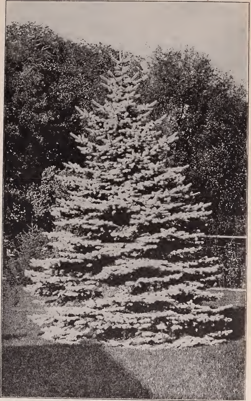
SPECIMEN BLUE SPRUCE ( Picea pungens glauca ).