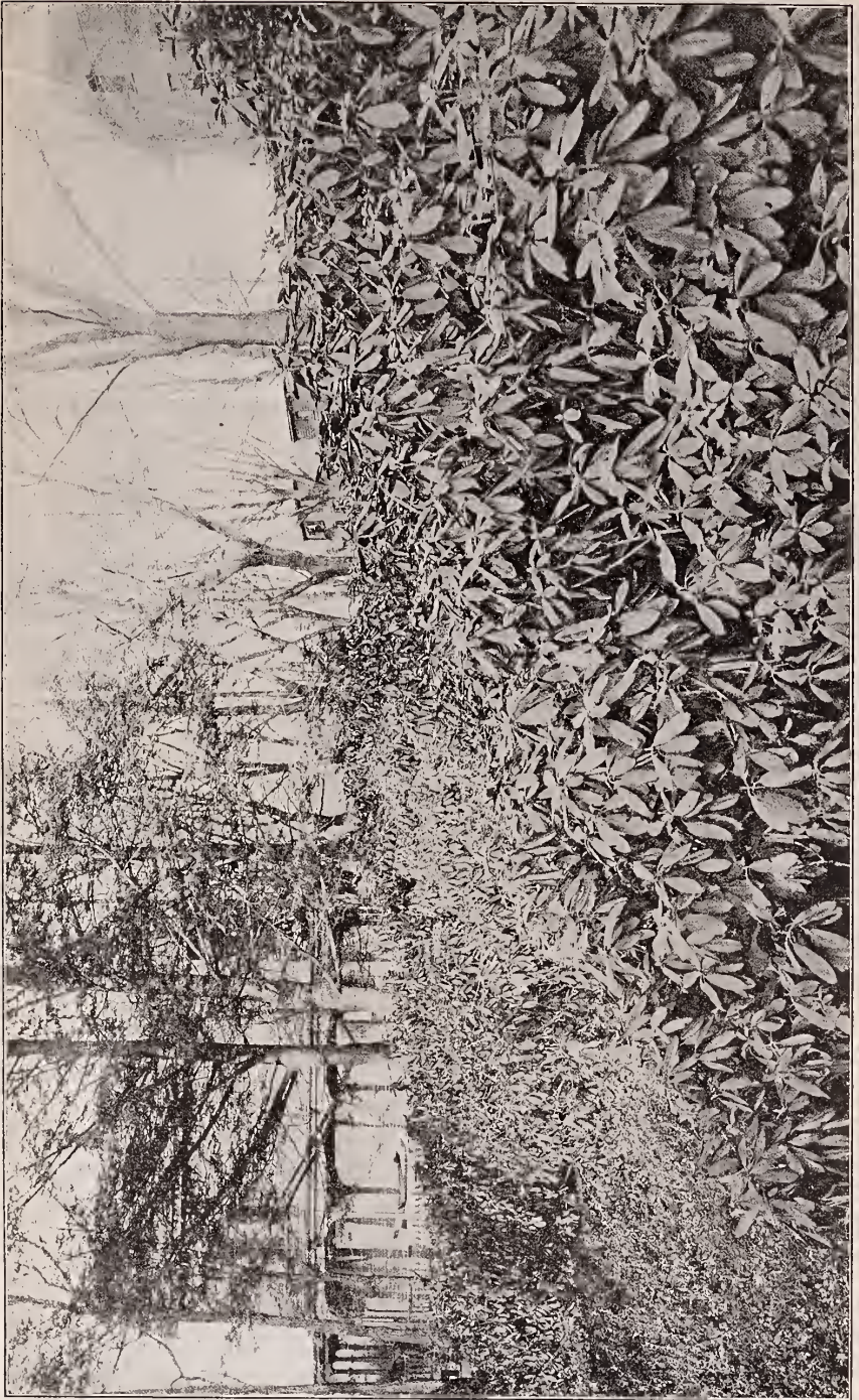
BANK OF RHODODENDRON MAXIMUM (at South Orange). For description see opposite, page 11.