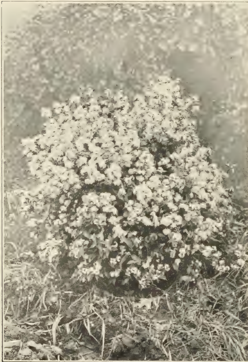
NEW DEUTZIA—HYBRIDA LEMOINEI.

A beautiful dwarf shrub, bearing pure white flowers in great profusion in July.