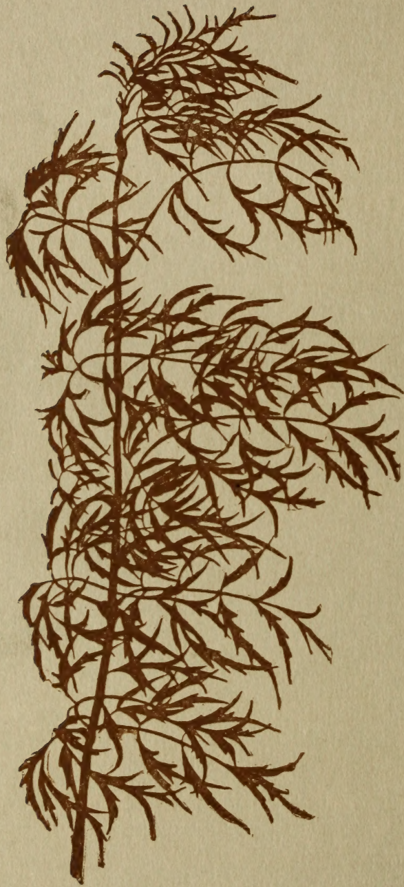
AMERICAN CUT-LEAVED ELDER (NEW).