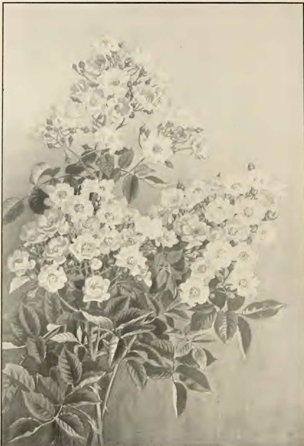
NEW PINK RAMBLER ROSE—QUEEN ALEXANDRA. Clusters large, showy, and of a beautiful pink color.