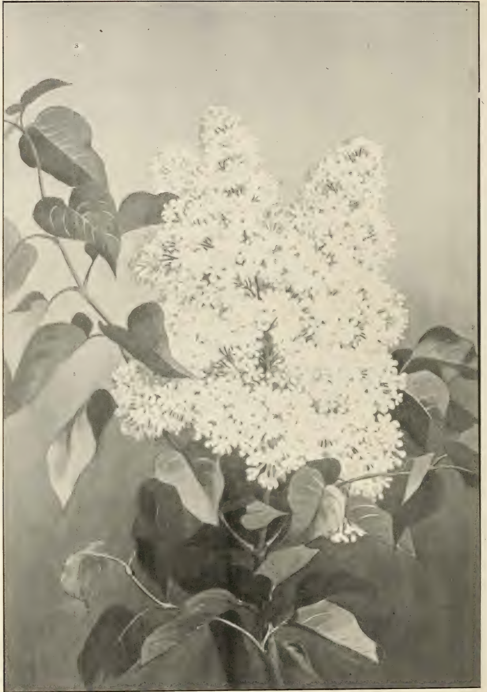
NEW DOUBLE LILAC.