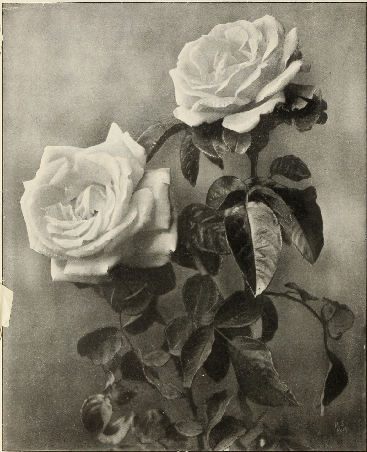
NEW HARDY WHITE HYBRID PERPETUAL ROSE FRAU DRUSCHKI.