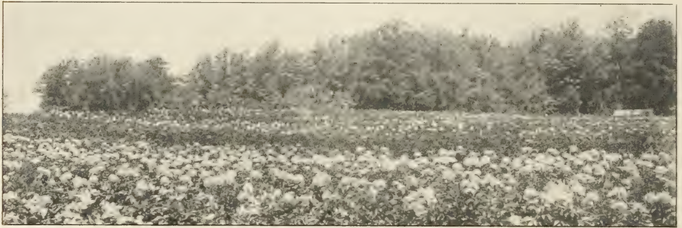
A FIELD OF PEONIES IN OUR NURSERIES.