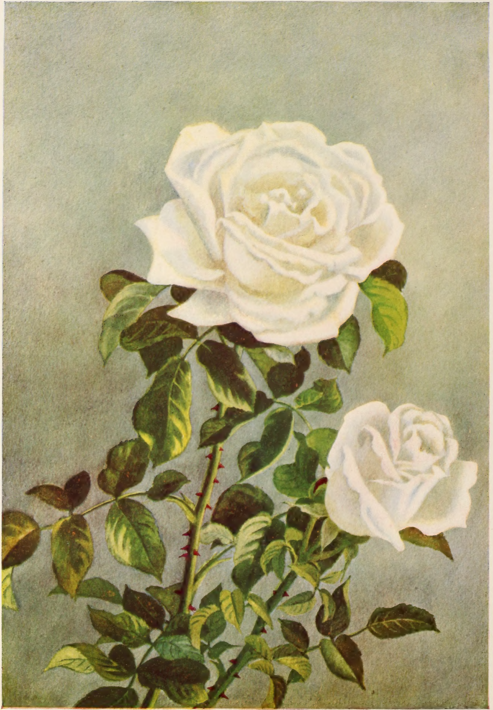
FRAU KARL DRUSCHKI NEW WHITE HYBRID PERPETUAL ROSE

COPYRIGHTED 1906 BY ELLWANGER & BARRY ROCHESTER, N. Y.