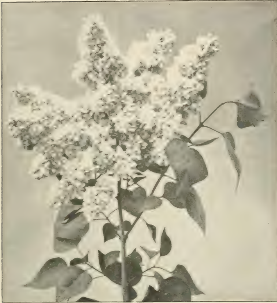
DOUBLE LILAC—EMILE LEMOINE.