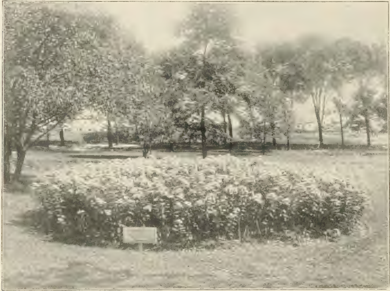
A BED OF PHLOX LOTHAIR AT ST. LOUIS WORLD'S FAIR, 1904.