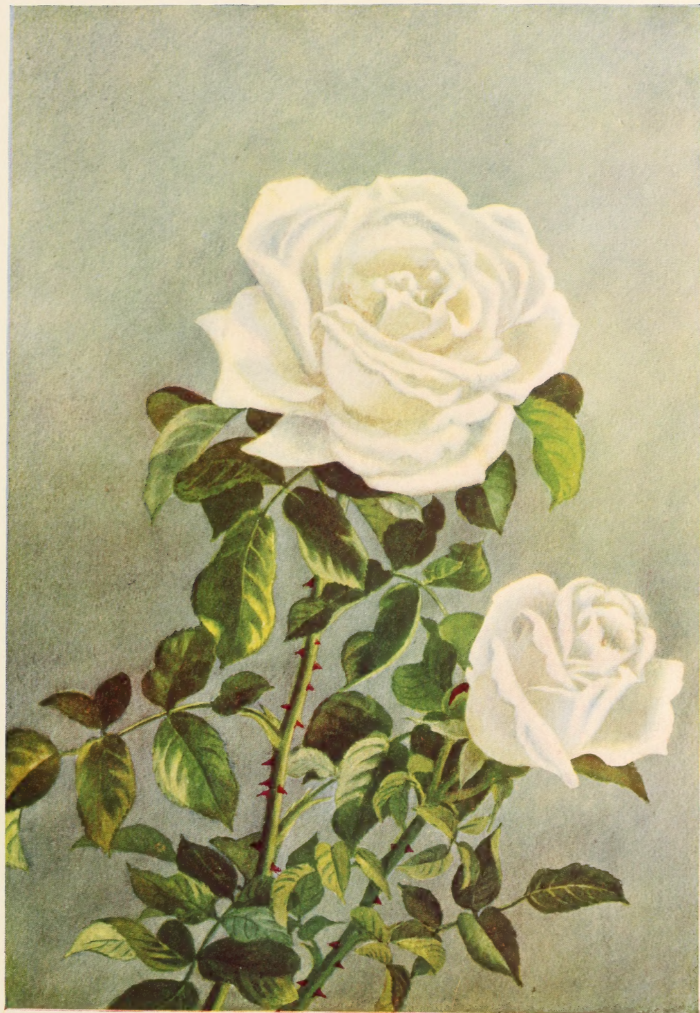
FRAU KARL DRUSCHKI NEW WHITE HYBRID PERPETUAL ROSE