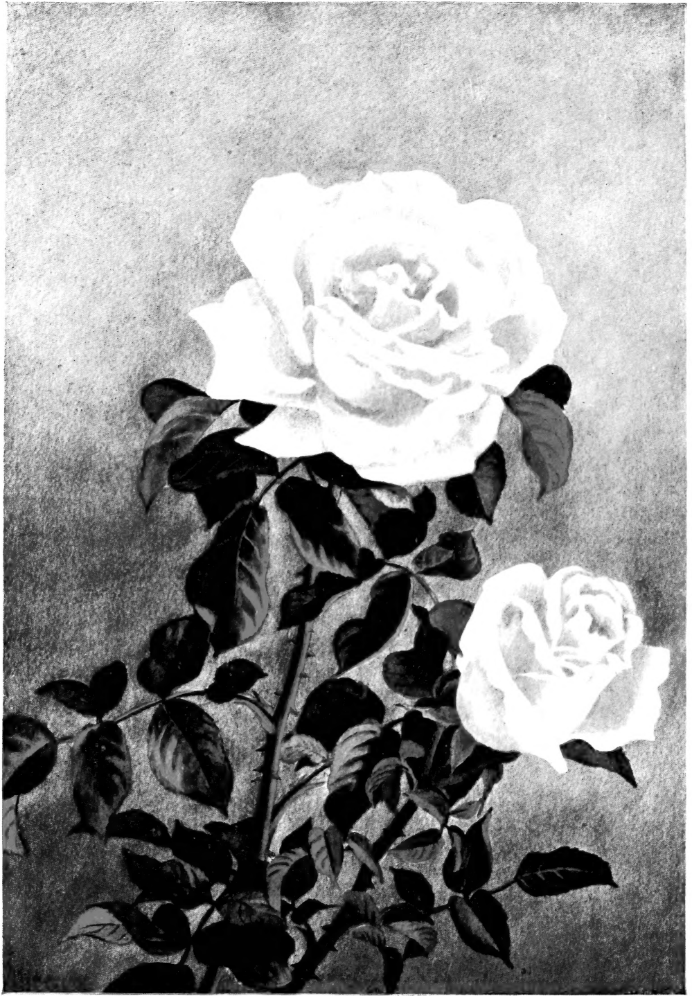
FRAU KARL DRUSCHKI NEW WHITE HYBRID PERPETUAL ROSE

COPYRIGHTED '13 BY ELLWANGER & BARRY ROCHESTER, N. Y.