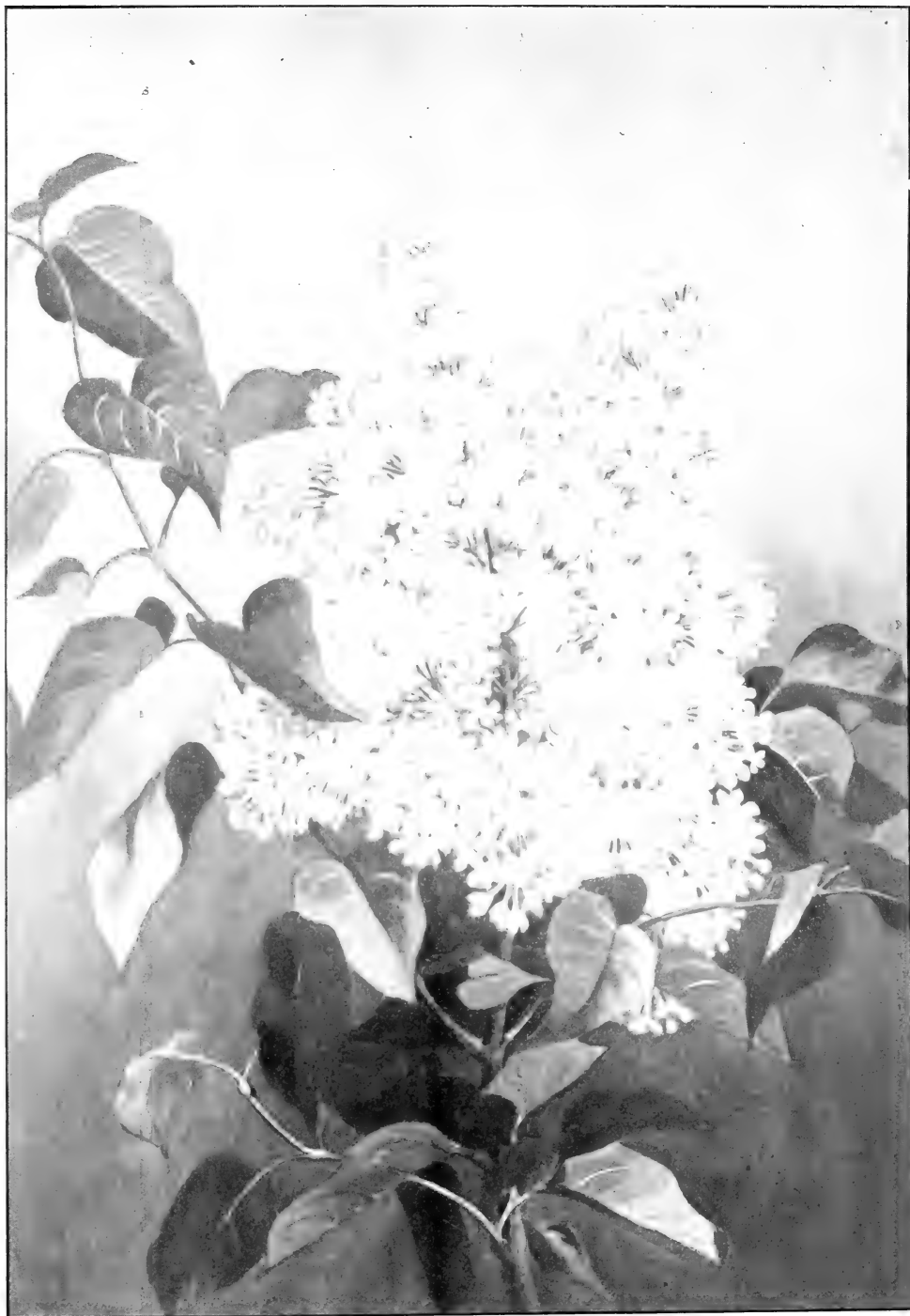
NEW DOUBLE LILAC.