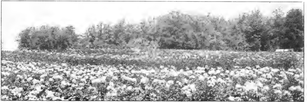
A FIELD OF PEONIES IN OUR NURSERIES.