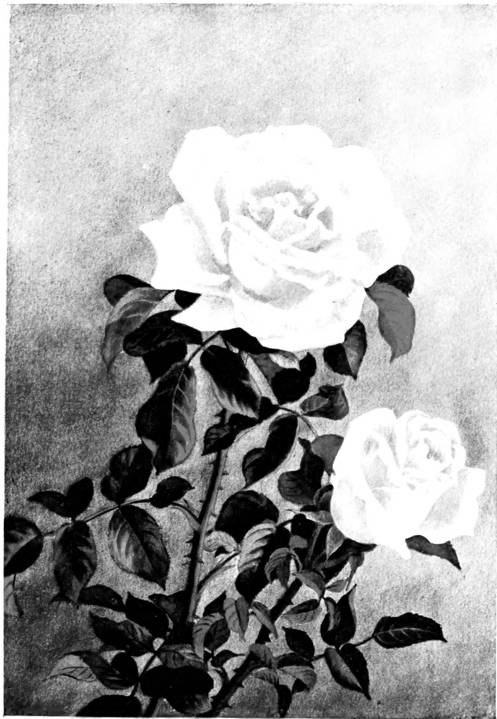
FRAU KARL DRUSCHKI NEW WHITE HYBRID PERPETUAL ROSE