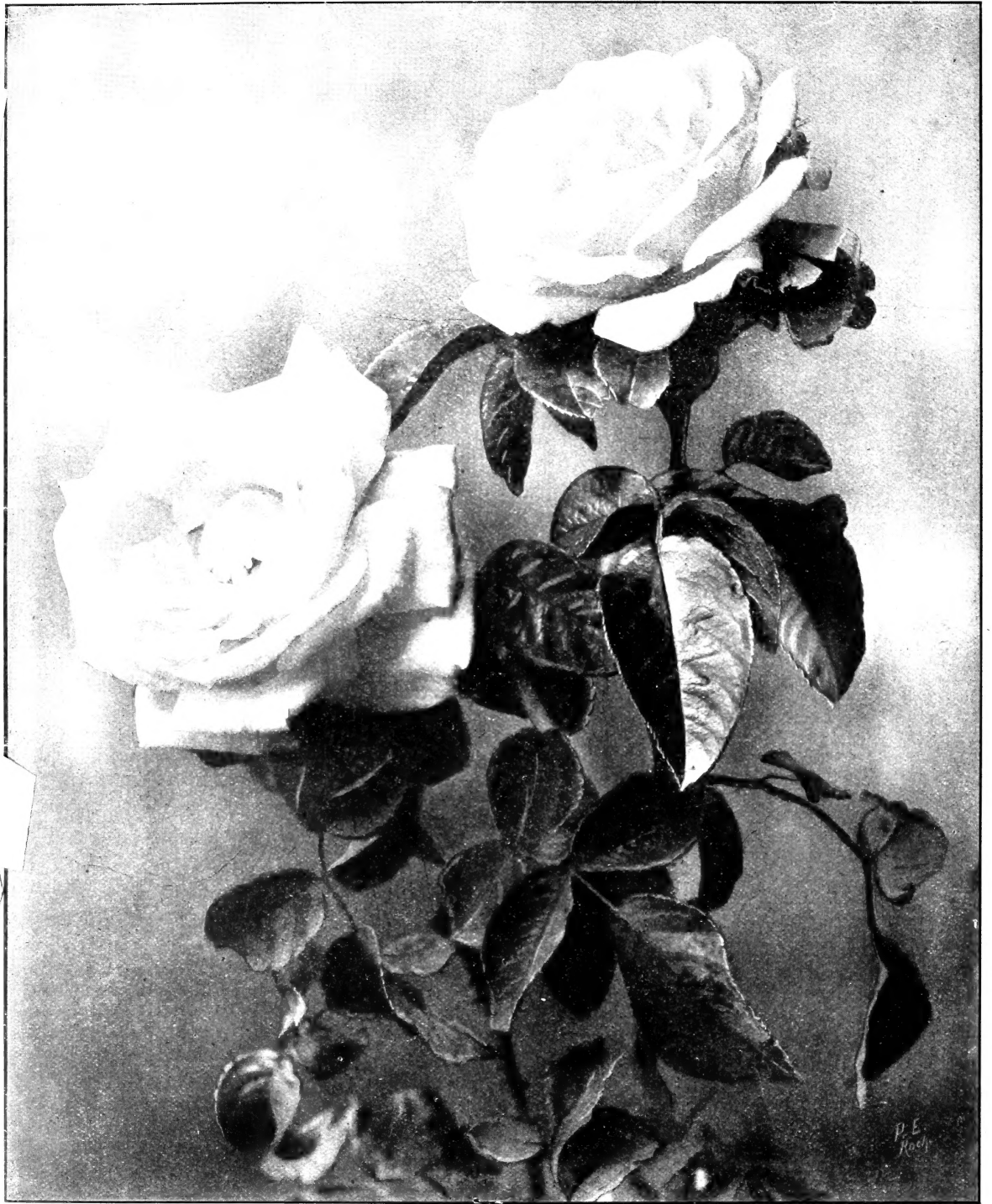
NEW HARDY WHITE HYBRID PERPETUAL ROSE FRAU DRUSCHKI.