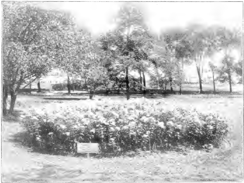
A BED OF PHLOX LOTHAIR AT ST. LOUIS WORLD'S FAIR, 1904.