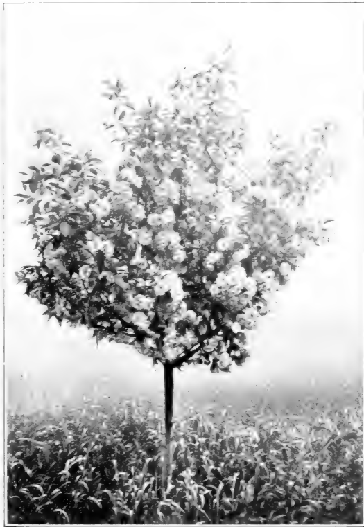
BECHTEL'S DOUBLE PINK CRAB. A Flowering Tree of the Highest Merit.