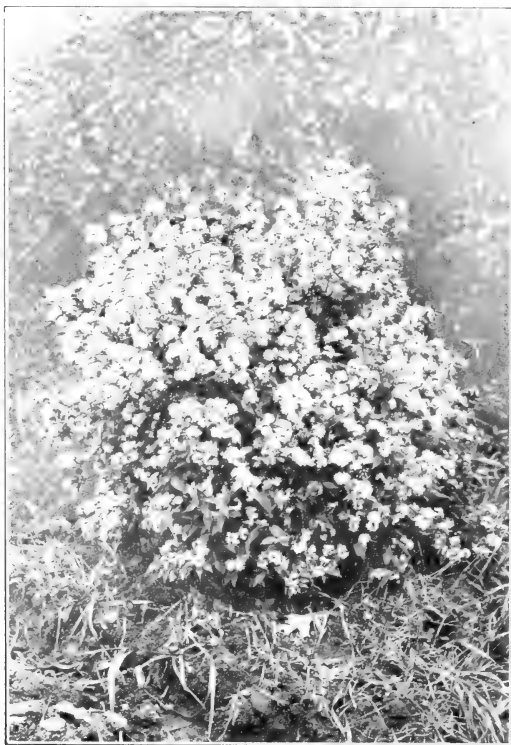
NEW DEUTZIA—HYBRIDA LEMOINEI.

A beautiful dwarf shrub, bearing pure white flowers in great profusion in July.