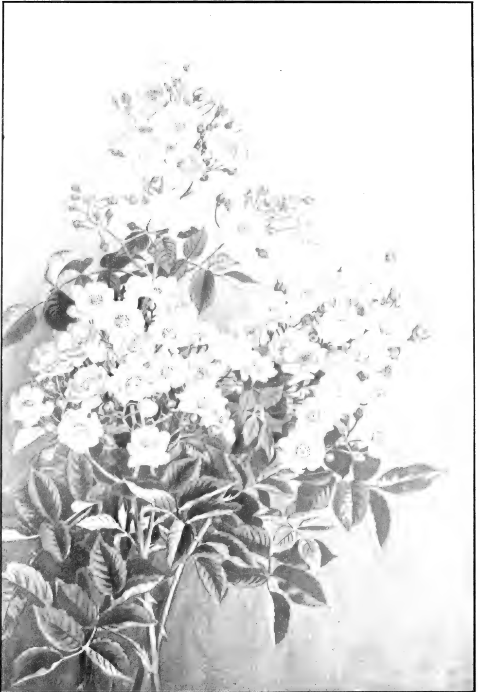
NEW PINK RAMBLER ROSE—QUEEN ALEXANDRA. Clusters large, showy, and of a beautiful pink color.