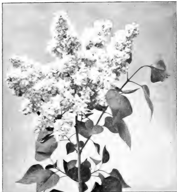
DOUBLE LILAC—EMILE LEMOINE.