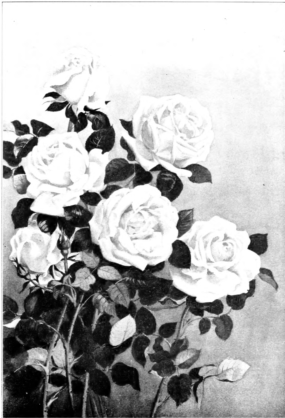
NEW HARDY WHITE ROSE—FRAU KARL DRUSCHKI. (½ Natural Size.)

A continuous bloomer. The most valuable novelty of recent years.