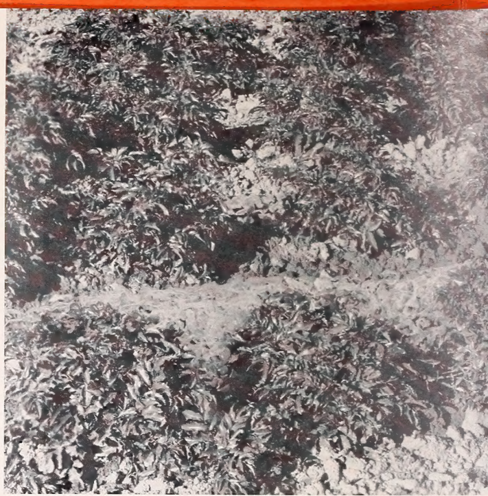
MAHONIA COMPACTA Interesting foliage, neat habit, dependably hardy.

Contemporary architecture requires the informal beauty of broadleaf evergreens. Their use in landscape plantings has increased ten times in only a few years. In our list you will find all the varieties best adapted to soils and climate of the mountain states. You are always welcome to visit the nursery where you can see them growing.