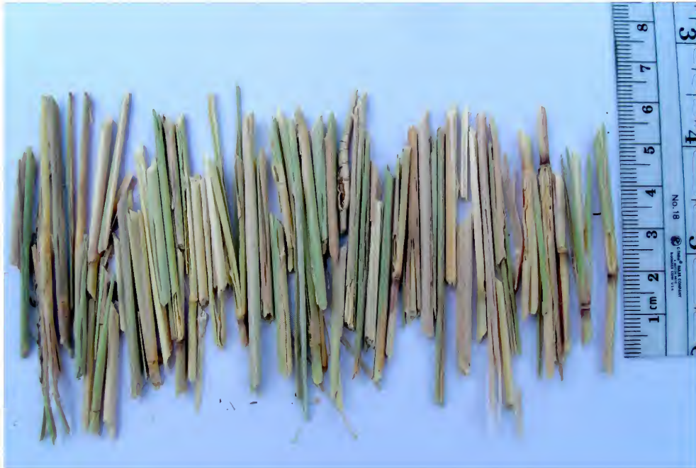
Figure 5. Sample of cut grass stems collected along a surface runway where a Yellow-nosed Cotton Rat ( Sigmodon ochrognathus ) was captured along US Highway 180 in Catron County, New Mexico. Originally, stems in the photograph were part of a pile of stems that contained 64 cut sections.

S. ochrognathus was captured with the Hispid Cotton Rat ( Sigmodon hispidus ) at Site A (Geluso 2009a, 2009b). Yellow-nosed Cotton Rats also have been reported to be sympatric with S. fulviventor in Durango and Chihuahua, Mexico (Baker 1969; Anderson 1972) and with S. hispidus in Arizona (Hoffmeister 1963).