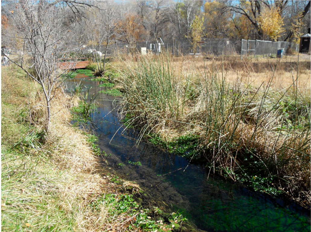
Figure 4. Habitat along a permanent, human-made stream at the Glenwood State Fish Hatchery in Catron County, New Mexico (Site 7). Plants along the bank included softstem bulrush ( Schoenoplectus tabernaemontani ), horsetails ( Equisetum ), Johnsongrass ( Sorghum halepense ), tall fescue ( Schedonorus arundinaceus ), and lovegrass ( Eragrostis ). Photo taken on 24 November 2015.

female captured on 20 October represented the latest direct evidence of reproductive activity in New Mexico. Thus, females are reproductively active (pregnant and/or lactating) in the state at least from March to October. However, the female captured on 31 March 2003 suggests occasional reproductive activity in mid to late winter. In Arizona and Texas, females are reported to be reproductively active throughout the year (Hoffmeister 1963; Baccus 1971).