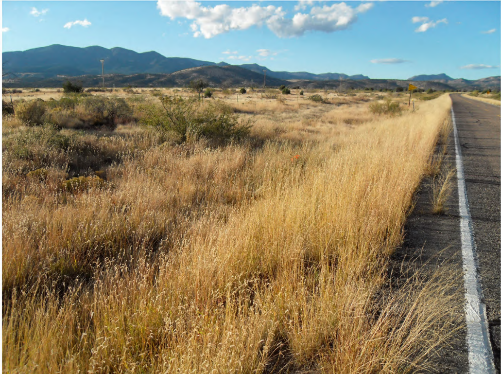
Figure 2. Grassy right-of-way along US Highway 180 in Catron County, New Mexico. At this location (Site 9), sideoats grama ( Bouteloua curtipendula ) and blue grama ( B. gracilis ) were the dominant grasses, silver bluestem ( Bothriochloa laguroides ) and green sprangletop ( Leptochloa dubia ) also were present, and honey mesquites ( Prosopis glandulosa ) were present but widely dispersed. Photo taken on 2 November 2016.

At Site 9 on 1 November 2016, three separate samples of vegetative cuttings were collected along surface runways used by S. ochrognathus (Fig. 2). The number of cut sections was determined for each sample, and the length of each section was measured.