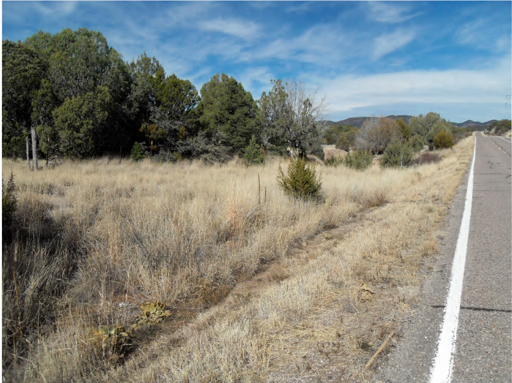
Figure 3. Northernmost capture site for the Yellow-nosed Cotton Rat ( Sigmodon ochrognathus ) in New Mexico (Site 10 in Catron County, N33°30.186', W108°55.659'). Numerous stones covered a fine-grained, powdery soil. Grasses included sideoats grama ( Bouteloua curtipendula ), blue grama ( B. gracilis ), hairy grama ( B. hirsuta ), bluestem ( Andropogon ), and three-awn ( Aristida ). Other vegetation included junipers ( Juniperus ), rabbitbrush ( Chrysothamnus ), honey mesquite ( Prosopis glandulosa ), catclaw ( Acacia or Mimosa ), cholla ( Opuntia ), prickly pear ( Opuntia ), broom snakeweed ( Gutierrezia sarothrae ), and common mullein ( Verbascum thapsus ). Beyond the fence, junipers, pinyon pines ( Pinus edulis ), and oaks ( Quercus ) were present; and the ground contained patches with large rocks. Photo taken on 9 January 2017.

length. Such habitats are similar to those occupied by S. ochrognathus in other parts of its range. For example, in New Mexico, individuals were observed on rocky hillsides with bunch grass, succulents, shrubs as well as pinyons, junipers, and oaks (Findley and Jones 1960; Findley et al. 1975). In Arizona, individuals were captured in grassy, rocky slopes near or within the oak belt with mention of blue grama, side-oats grama, three-awn, catclaw, mesquite, prickly pear, and junipers (Hoffmeister 1963). In Texas, S. ochrognathus was documented in rocky slopes with grammas, bluestem, pinyons, junipers, and oaks (Baker 1969; Baccus 1971;