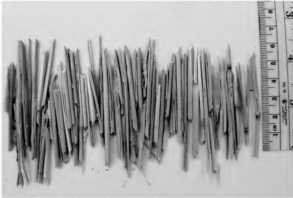
Figure 5. Sample of cut grass stems collected along a surface runway where a Yellow-nosed Cotton Rat ( Sigmodon ochrognathus ) was captured along US Highway 180 in Catron County, New Mexico. Originally, stems in the photograph were part of a pile of stems that contained 64 cut sections.

S. ochrognathus was captured with the Hispid Cotton Rat ( Sigmodon hispidus ) at Site A (Geluso 2009a, 2009b). Yellow-nosed Cotton Rats also have been reported to be sympatric with S. fulviventor in Durango and Chihuahua, Mexico (Baker 1969; Anderson 1972) and with S. hispidus in Arizona (Hoffmeister 1963).