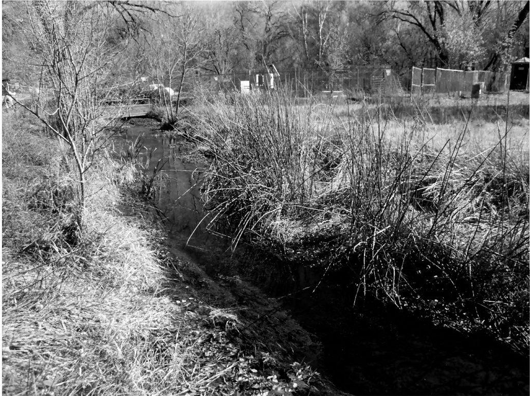
Figure 4. Habitat along a permanent, human-made stream at the Glenwood State Fish Hatchery in Catron County, New Mexico (Site 7). Plants along the bank included softstem bulrush ( Schoenoplectus tabernaemontani ), horsetails ( Equisetum ), Johnsongrass ( Sorghum halepense ), tall fescue ( Schedonorus arundinaceus ), and lovegrass ( Eragrostis ). Photo taken on 24 November 2015.

female captured on 20 October represented the latest direct evidence of reproductive activity in New Mexico. Thus, females are reproductively active (pregnant and/or lactating) in the state at least from March to October. However, the female captured on 31 March 2003 suggests occasional reproductive activity in mid to late winter. In Arizona and Texas, females are reported to be reproductively active throughout the year (Hoffmeister 1963; Baccus 1971).