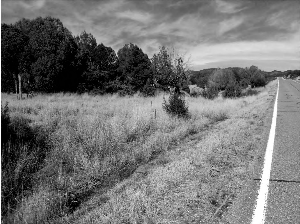
Figure 3. Northernmost capture site for the Yellow-nosed Cotton Rat ( Sigmodon ochrognathus ) in New Mexico (Site 10 in Catron County, N33°30.186', W108°55.659'). Numerous stones covered a fine-grained, powdery soil. Grasses included sideoats grama ( Bouteloua curtipendula ), blue grama ( B. gracilis ), hairy grama ( B. hirsuta ), bluestem ( Andropogon ), and three-awn ( Aristida ). Other vegetation included junipers ( Juniperus ), rabbitbrush ( Chrysothamnus ), honey mesquite ( Prosopis glandulosa ), catclaw ( Acacia or Mimosa ), cholla ( Opuntia ), prickly pear ( Opuntia ), broom snakeweed ( Gutierrezia sarothrae ), and common mullein ( Verbascum thapsus ). Beyond the fence, junipers, pinyon pines ( Pinus edulis ), and oaks ( Quercus ) were present; and the ground contained patches with large rocks. Photo taken on 9 January 2017.

length. Such habitats are similar to those occupied by S. ochrognathus in other parts of its range. For example, in New Mexico, individuals were observed on rocky hillsides with bunch grass, succulents, shrubs as well as pinyons, junipers, and oaks (Findley and Jones 1960; Findley et al. 1975). In Arizona, individuals were captured in grassy, rocky slopes near or within the oak belt with mention of blue grama, side-oats grama, three-awn, catclaw, mesquite, prickly pear, and junipers (Hoffmeister 1963). In Texas, S. ochrognathus was documented in rocky slopes with grammas, bluestem, pinyons, junipers, and oaks (Baker 1969; Baccus 1971;