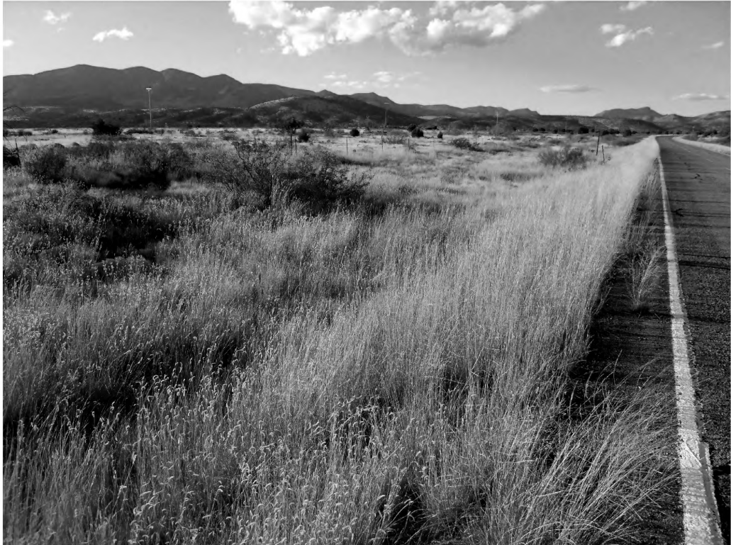
Figure 2. Grassy right-of-way along US Highway 180 in Catron County, New Mexico. At this location (Site 9), sideoats grama ( Bouteloua curtipendula ) and blue grama ( B. gracilis ) were the dominant grasses, silver bluestem ( Bothriochloa laguroides ) and green sprangletop ( Leptochloa dubia ) also were present, and honey mesquites ( Prosopis glandulosa ) were present but widely dispersed. Photo taken on 2 November 2016.

At Site 9 on 1 November 2016, three separate samples of vegetative cuttings were collected along surface runways used by S. ochrognathus (Fig. 2). The number of cut sections was determined for each sample, and the length of each section was measured.