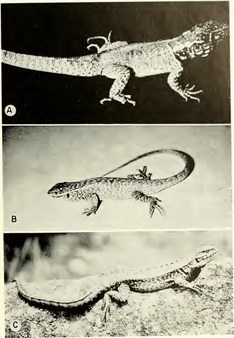
FIG. 2. A. Stenocercus praematus , cf. KU 134224-134232, ♂ approximate snout-vent length 100 mm. B. S. orientalis , KU 134456, ♂ 65 mm. C. S. nubicola , KU 134107, ♂ 72 mm.