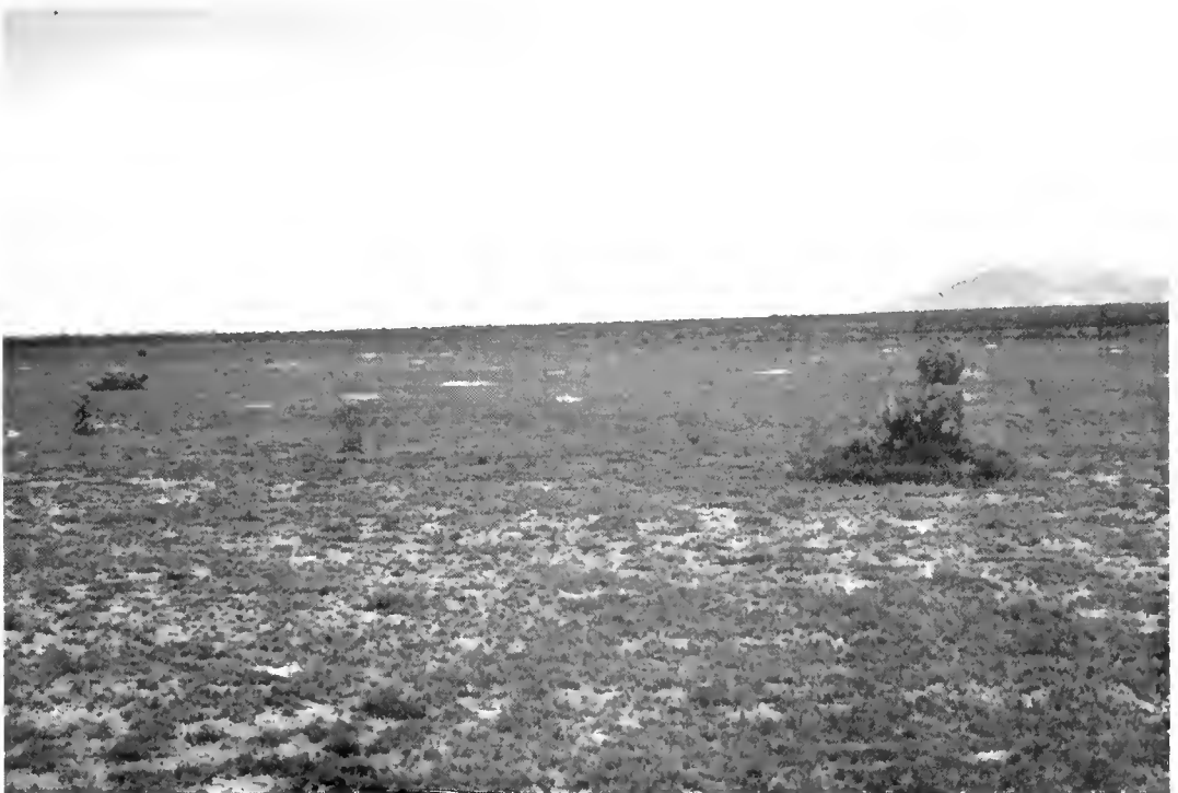
Fig. 3. Grassland Zone II. Cerro San Juan is on the left.

Grasslands at Ejido El Tokio can be classified into three zones (DETENAL, 1975). Zone I was relatively undisturbed, and Mexican prairie dogs were abundant. The 9.55 ha study site, located in this zone, was a halophyte grassland (DETENAL, 1975) dominated by Muhlenbergia villiflora and Frankenia gypsophila . Annuals began appearing by April in 1986 (Avalos-Marín, in prep.). Small patches of shrubs such as Koeberlinia spinosa , Opuntia imbricata , Larrea tridentata , and Condalia ericoides also occurred in this zone (Treviño-Villarreal, 1981). Zone II also was a halophyte grassland (DETENAL, 1975) dominated by Muhlenbergia villiflora , Aristida barbata , Frankenia gypsophila , and Bouteloua chasei (Fig. 3). Annuals began appearing by May in 1986 (Avalos-Marín, in prep.). All of the species of shrubs found in Zone I also occurred in Zone II (Treviño-Villarreal, 1981). In late January 1988, the study site and most of Zone I were plowed, and the entire colony of Mexican prairie dogs disappeared. In Zone II agriculture has spread rapidly in recent years, and populations of Mexican prairie dogs are being limited by human control. Zone III contains most of the human population of the Ejido, and the area is devoted solely to agriculture. Mexican prairie dogs no longer live in Zone III. Old residents of El Tokio say that Mexican prairie dogs were