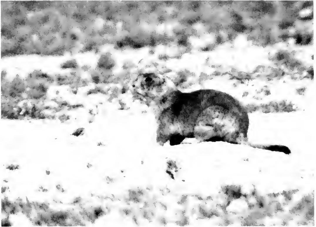
Fig. 1. A Mexican prairie dog ( Cynomys mexicanus ) in summer pelage.

1983). The purpose of this study was to gather baseline information on the reproduction, growth, development, molt patterns, and colony organization of Cynomys mexicanus .