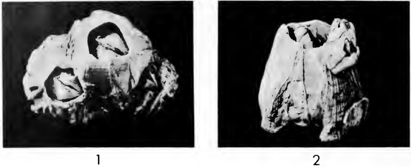
FIGURE 1. Balanus tintinnabulum californicus Pilsbry (center) with B. nubilus Darwin. Rodgers Break buoy, Humboldt County (CAS loc. 33294), carinorostral diameter of orifice 13.5 mm.