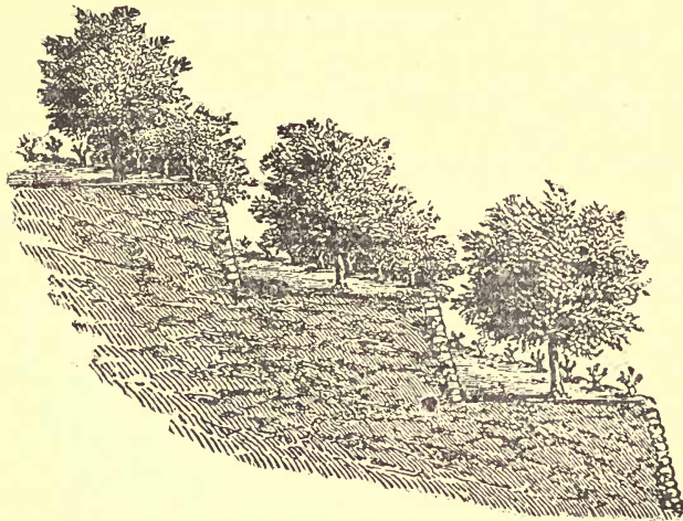
TERRACING VINES AND OLIVE TREES.

In places in Southern Europe, where every bit of land is turned to account, it not unfrequently happens that there is a steep, rocky corner where vines could not be profitably cul-