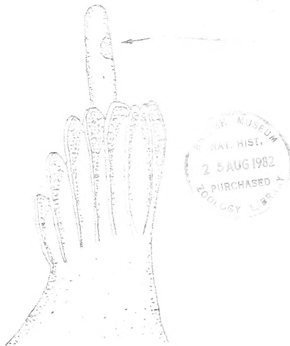
Figure 1. Rhinophore of colorless Rostanga pulchra collected in Morro Bay, California. Arrow points to patch of opaque white pigmentation.

On 15 August 1981, one 6mm specimen of Rostanga pulchra was collected in Morro Bay, California, which did not match the above color description. The specimen was collected on a sand substrate at a depth of 6m directly under the Coast Guard pier. The body was almost colorless; the only distinguishing coloration being a spot of white pigmentation on the back of the rhinophores (Figure 1). All other morphological features agreed with those of a typical R. pulchra .