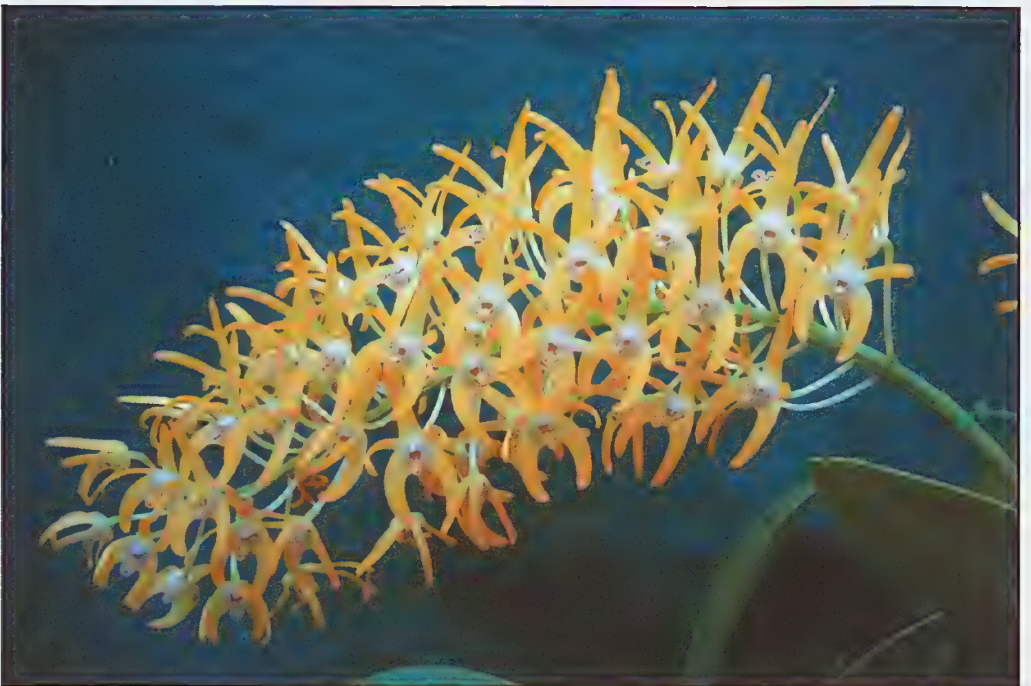
Dendrobium grandiflorum 'William'