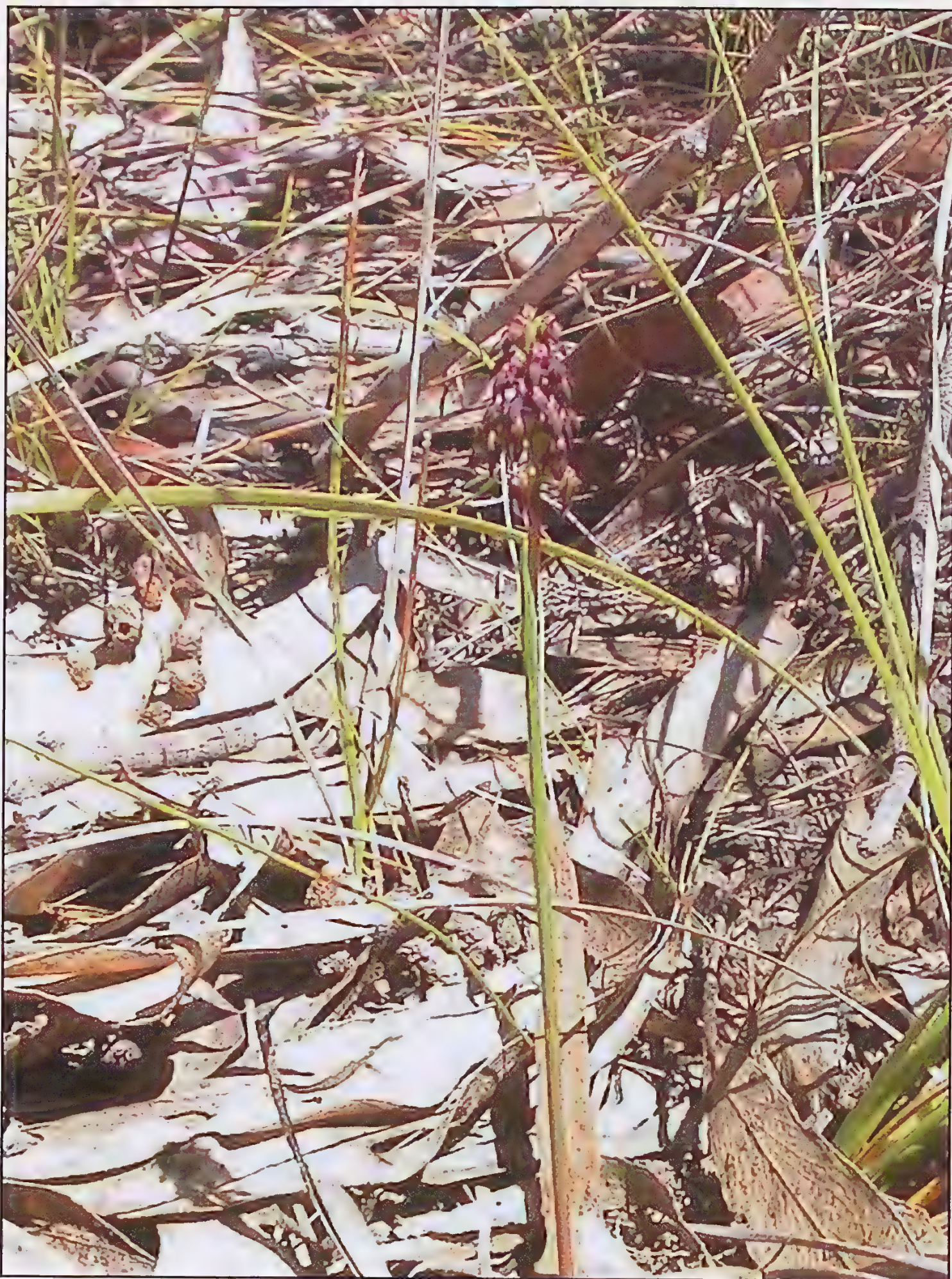
Genoplesium vernale ( Corunastylus vernale ) Growing in the Illawarra area.