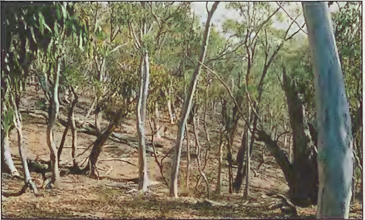
Habitat photo of the Sanctuary at Oolong