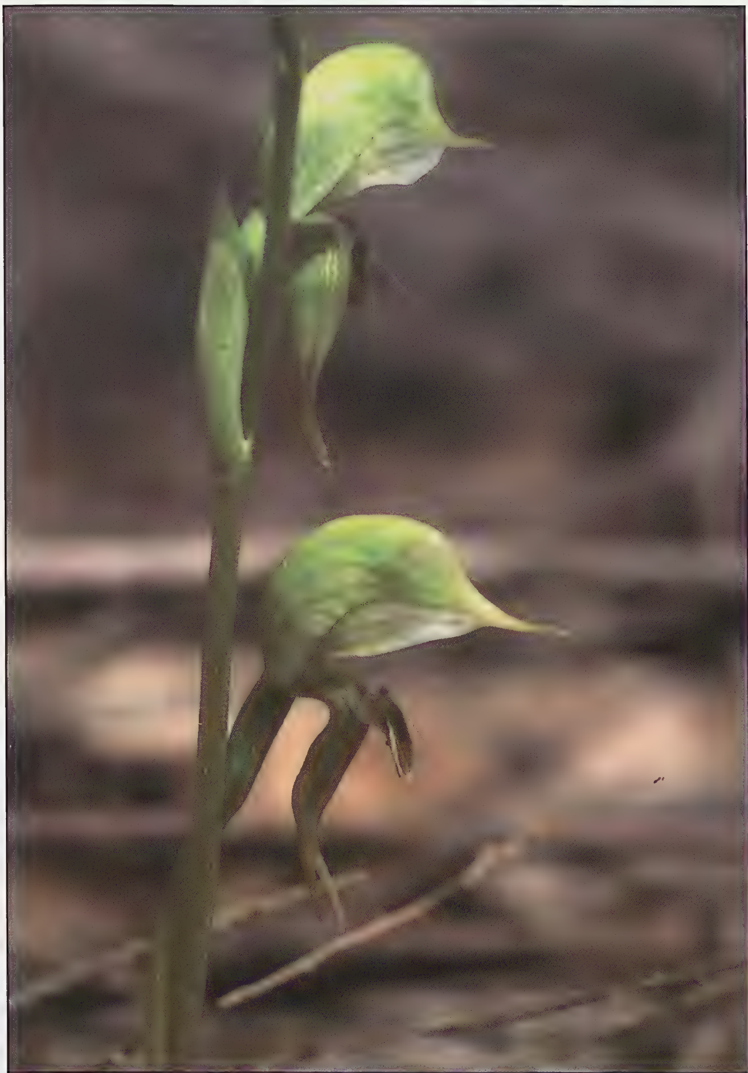
Pterostylis sp. nova Oolong