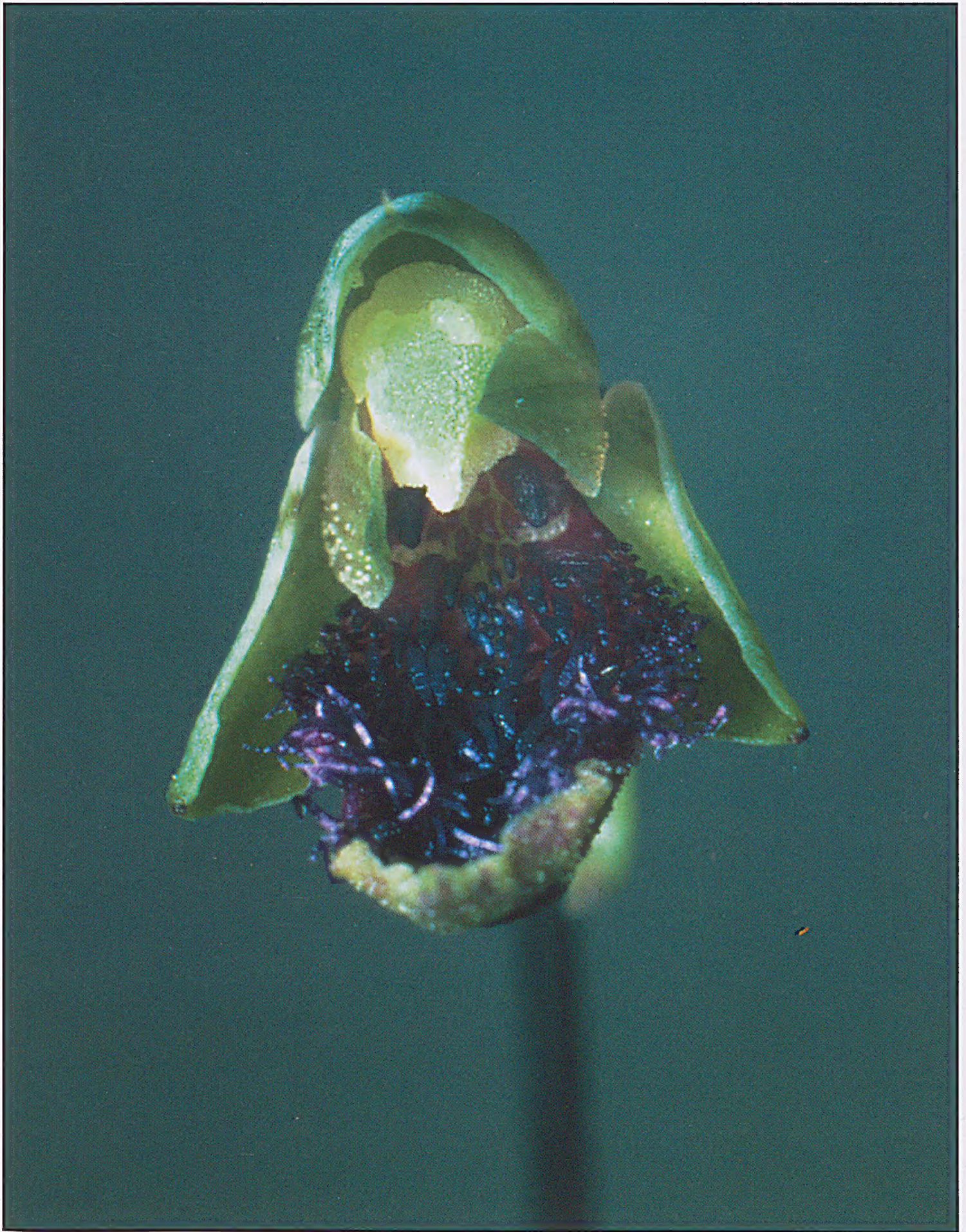
Calochilus ammobius Atherton Tablelands