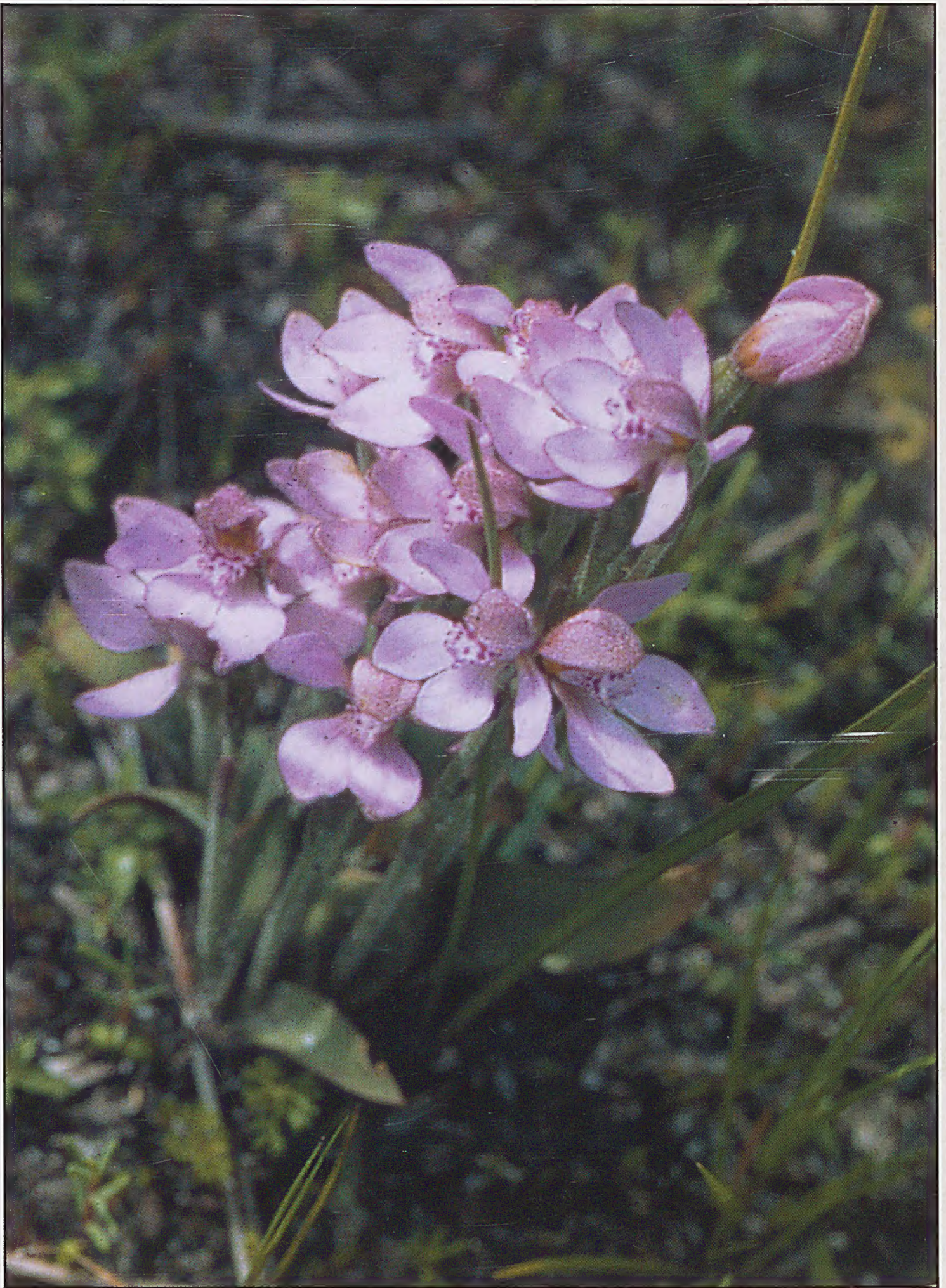
Caladenia nana susp. nana Forestdale Lake Nature Reserve