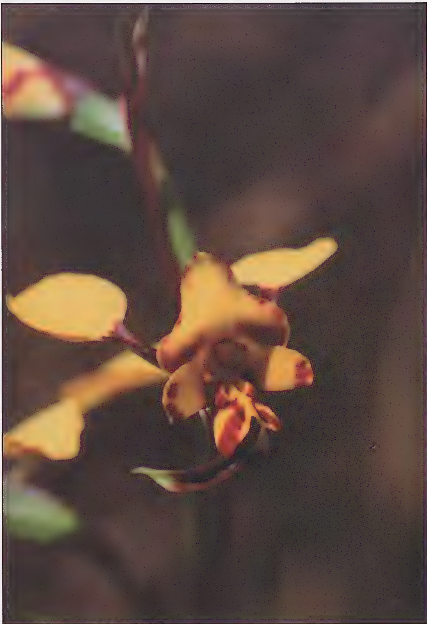
Diuris pardina growing in the Sanctuary at Oolong