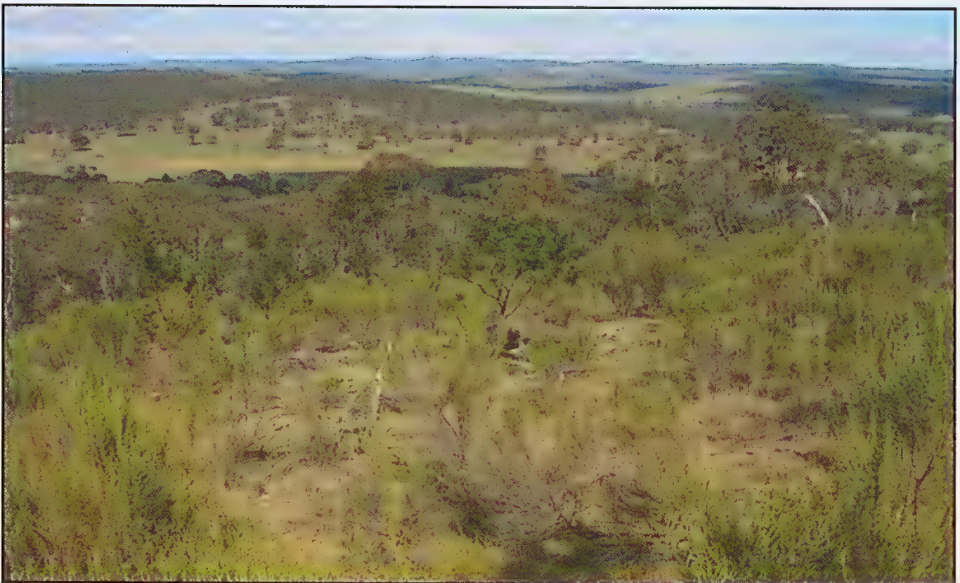
Habitat photo at Oolong

We checked out most of the areas we had looked at last time as well as a couple of new sites. Due to the dryness, we decided that unless more rain was received soon, we would not go back in November but would go in Autumn by which time we should have had decent rain and an improved flowering.