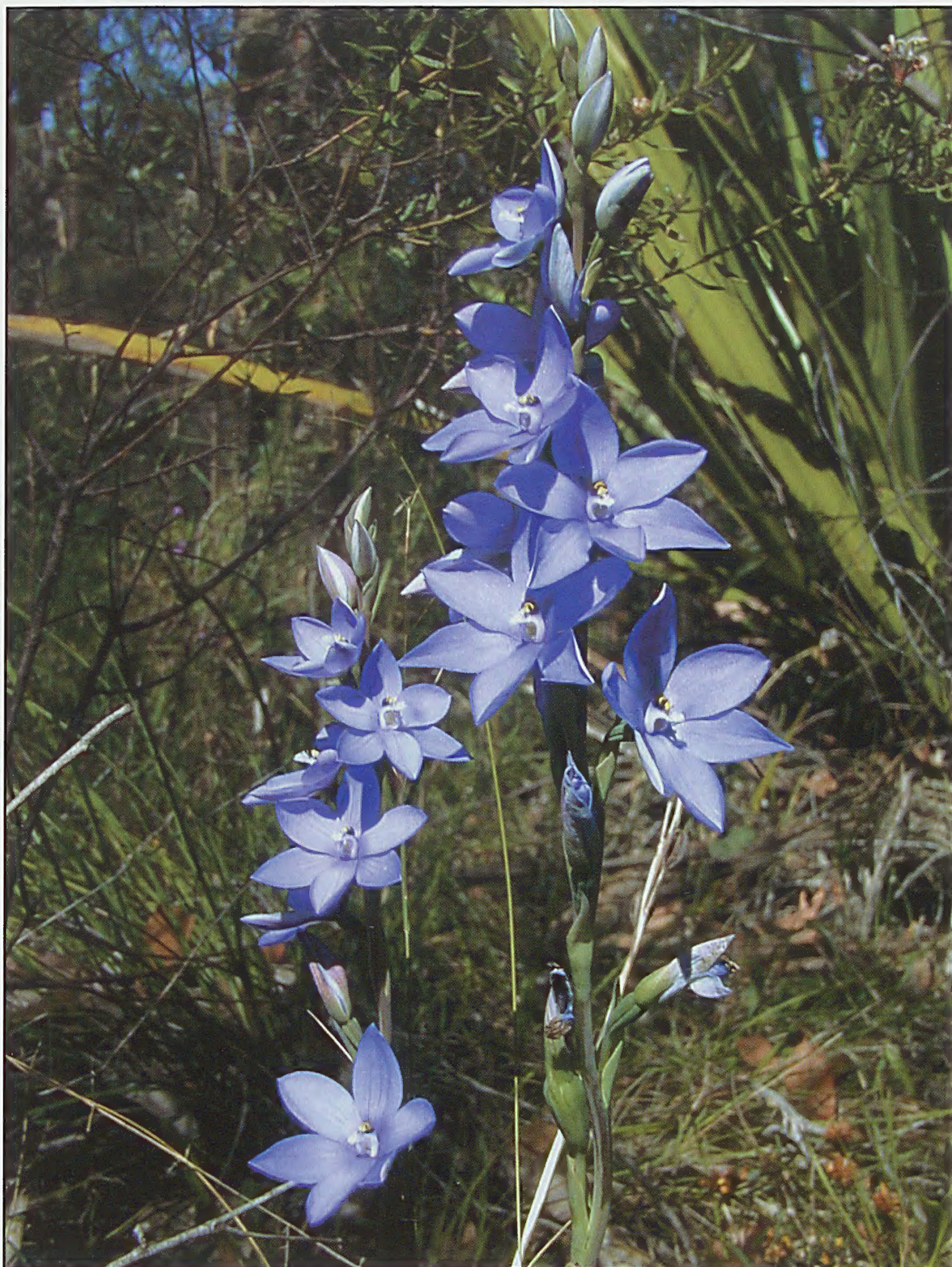
Thelymitra ixioides instu Garigal National Park (Robert Brown looked for plants in this area, but would have been too early to see the Sun Orchids, refer to Ruth Rudkins article: The 'Investigators' Plant Hunters, page 60.)