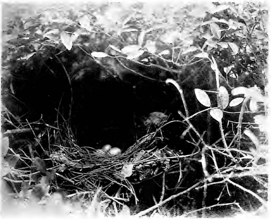
Nest and Eggs of Brown Thrasher

laurel oaks, one of each on each side of the mansion which sits toward the front of the garden in the middle of the square; two ivy-covered old osage orange trees; a Japanese plum which bears; several hollies ( Ilex opaca ); numerous trees of the Christmas berry ( Ilex vomitoria ); Japanese and California privets; a fine ginkgo; many different kinds of magnolia; dog-