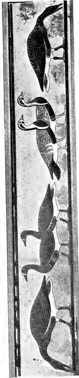
Frieze of Geese, painted in the Third Dynasty of Egypt