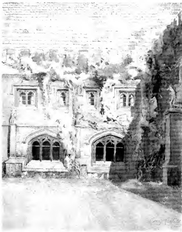
The Prince of Wales' Rooms, Magdalen College.