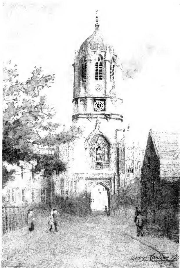
Tom Tower, Christ Church, containing "Great Tom," a bell formerly belonging to Osney Abbey.