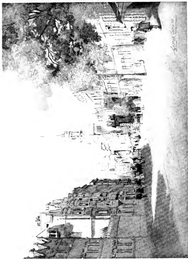
The High, universally acknowledged to be one of the finest streets in Europe