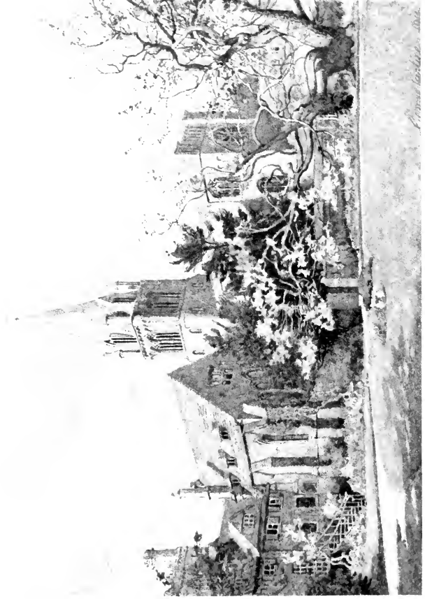
Christ Church from one of the Canon's' Gardens.