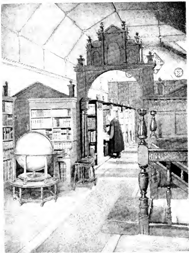
Merton Library, built in 1349 by William Rede, Bishop of Winchester, and considered to be one of the oldest libraries in England.