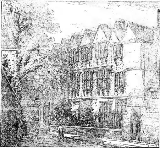
Old Episcopal Palace.

have known this picturesque reaction. The stir in these two countries was curiously characteristic of their genius. In France it put on, in the first