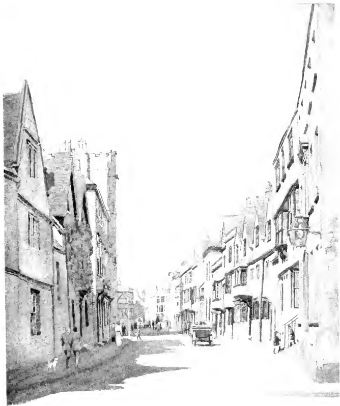
Holywell Street, containing some interesting examples of old domestic architecture, with New College on the left.