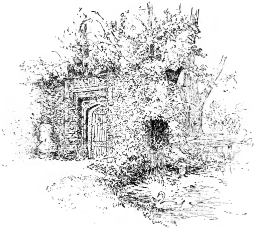
In the Garden of Worcester College.

interference can be of real value? Friendship and confidence may, and often does, exist between tutors and pupils. There are tutors so