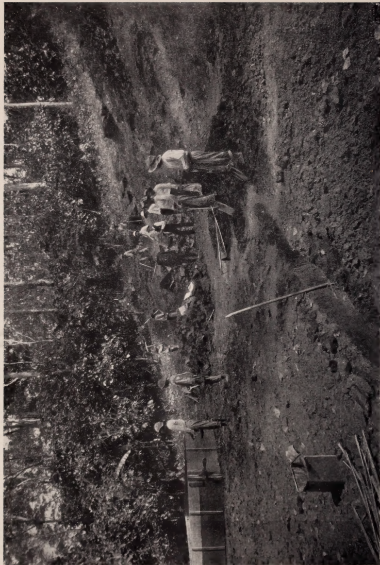
Fossil deposit, Springvale, Couva.