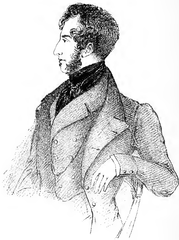
Edward Lytton Bulwer