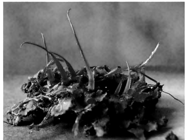
A Hornwort