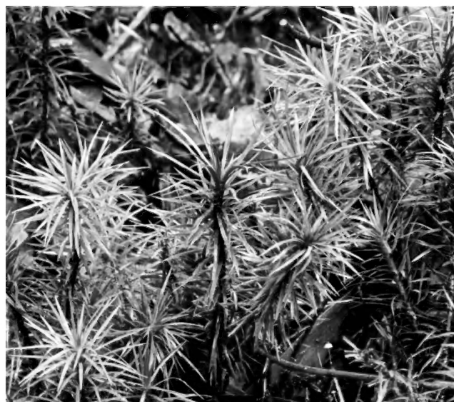
Dawsonia superba