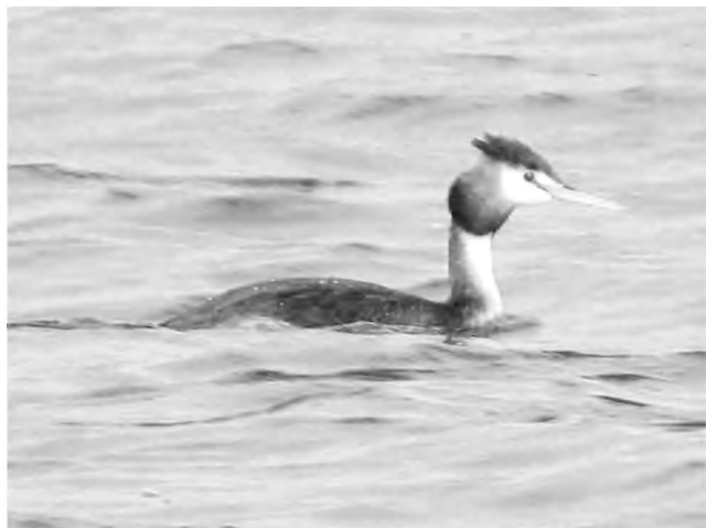
Great Crested Grebe at Devilbend

Honeyeater were seen – the latter a first for one of our members. The species total for this site came to 44 with the addition of a Fan-tailed Cuckoo which came to watch us having lunch.