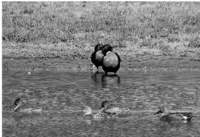
A fine collection of ducks.

Our regular birding day for April was brought forward by a week because of Easter, so fell at the end of March. We began at Balbirooroo Wetlands in Balnarring, a reliable spot for a great variety of waterbirds, usually including Shelducks. The Shelducks were there, together with an assortment of other ducks including Freckled, Australian Shoveller, Hardhead and both Teal. One Blue-billed Duck was sighted. White-necked and White-faced Herons, Straw-necked and White Ibis, and Yellow-billed Spoonbill were also present.