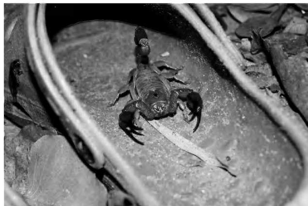
Check your shoes carefully!

us Burton's snake-lizard, frill necked lizards, Gilberts dragon, the Top End firetail skink, Stimson's python and white-bellied mangrove snake, plus giant frogs and green tree frogs.