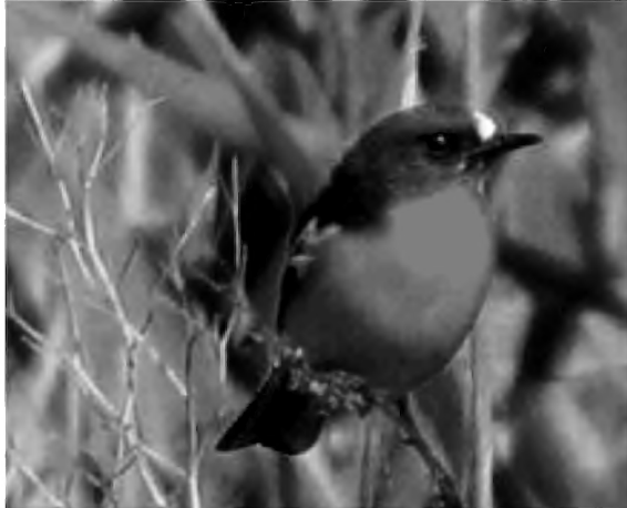
Flame Robin

Ten members turned out on a fine and warm day with no wind and a clear sky. The chief attraction at this time of the year is Flame Robins. Last year we saw only a single Flame Robin at the wetlands – this year we were more successful with 3 males and 4 females.