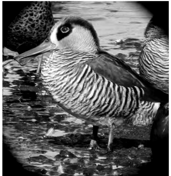
Pink-eared Duck

Along the western side the pond held thirty or so Pink-eared Ducks, together with the Grey and Chestnut Teal. Three or four Australasian Shovellers were also seen.