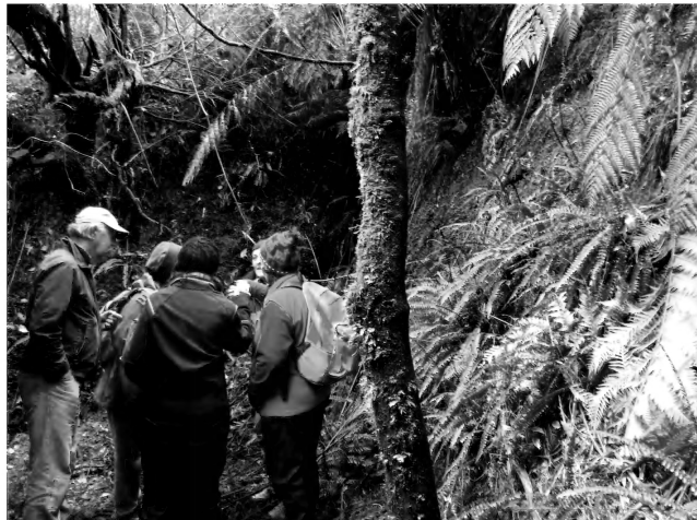
Embankment behind the old toilet block at Cement Creek