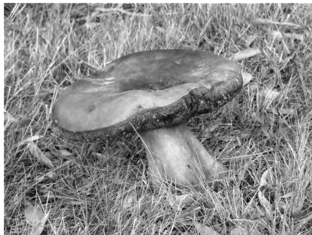
Phlebopus marginatus