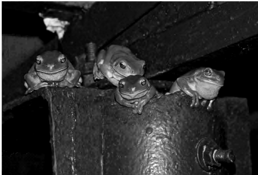
One more from Broome Bird Observatory