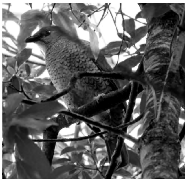
Juvenile Satin Bowerbird

The highlights were a motley collection of hybrid mallard/domestic ducks, a juvenile bowerbird, and a plantation of Californian Redwoods, planted in 1922 and a majestic size in less than 100 years.