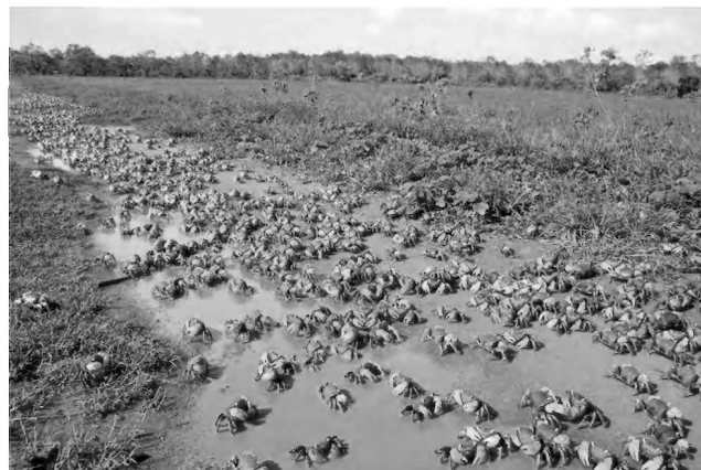
Crabs on the move

A major highlight was the crabs – Roger was very fortunate to see the land crabs moving in great numbers after the rain started, from the plain along the tracks to the sea to spawn, then all returning to the plains. Because the road to Broome is closed after rain, most people would never see this sight, reminiscent of the famous Christmas Island crab migration.