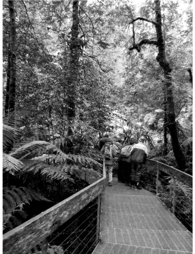
On the Rainforest Gallery Skywalk

I have not attempted to record the names of all of the bryophytes and lichens we saw – there were just too many. Listing the birds was not such a problem –the only one was a lyrebird heard but not seen.