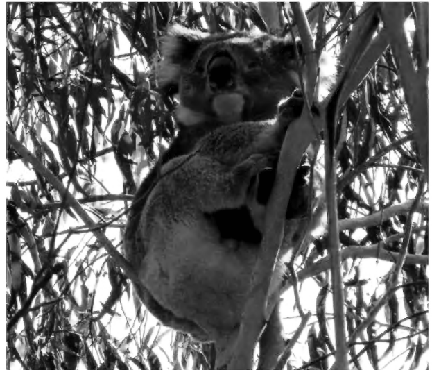
Koala at Balnarring.