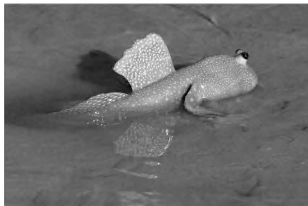
Mud Skipper – Photo: Roger Standen

Other highlights were photographs of the spectacular scenery – red cliffs, pink water after rain, the tide going out for 1 1/2 kilometres, monsoon clouds and the blue spotted mud skippers in the mud.