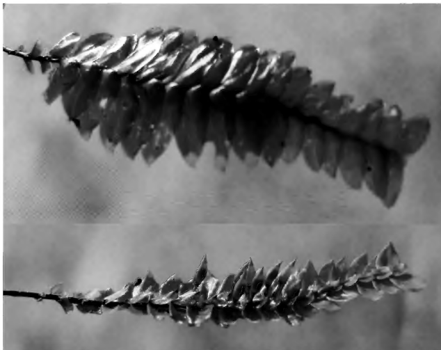
Cyathophorum bulbosum : top- upper surface; below: lower surface showing sporophytes

The old toilet block next to the carpark, a beautiful piece of post-war stonework, has been retained, partly for the great collection of bryophytes on the retaining wall behind it, and Pina showed us several different species amongst the great profusion growing along this wall. One of these was Cyathophorum bulbosum , described as “the most individualistic bryophyte in Australia, if not, indeed, the world”†. With its single unbranched leafy fronds standing out from the wall it could be taken for a delicate fern but for the sporophytes on its lower surface.