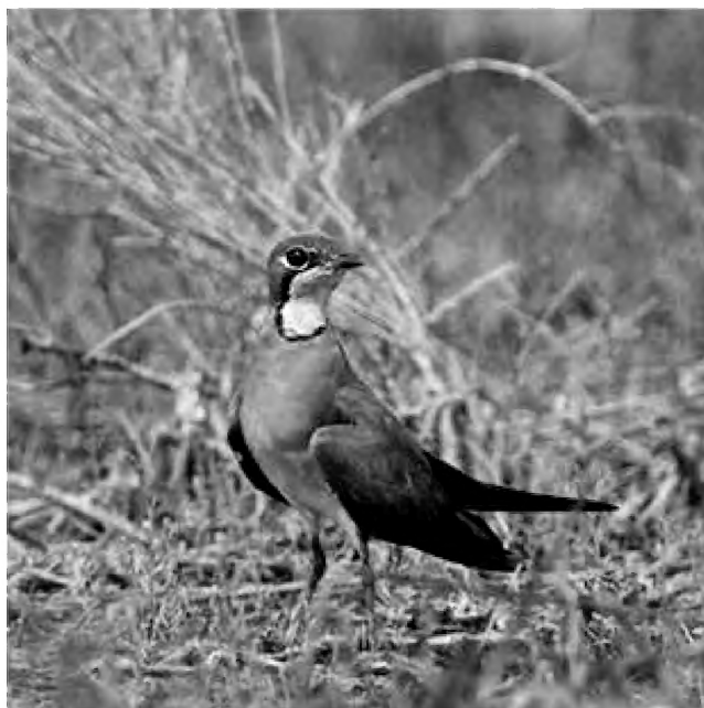
Oriental Pratincole – Photo: Roger Standen

thousands of birds, and when the rains came (they had 170ml in three days, in the second week of January) they brought birds to the flooded plain – glossy ibis, white-winged black terns, little curlew and big flocks of oriental pratincole. Other birds photographed were blue-winged kookaburras nesting in termite mounds, pheasant coucals, brown goshawk antics at the water dish and yellow chats.