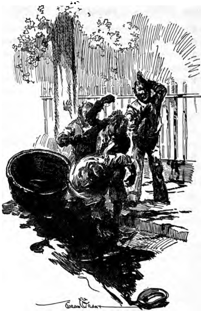
Thus began the Great Tar Fight