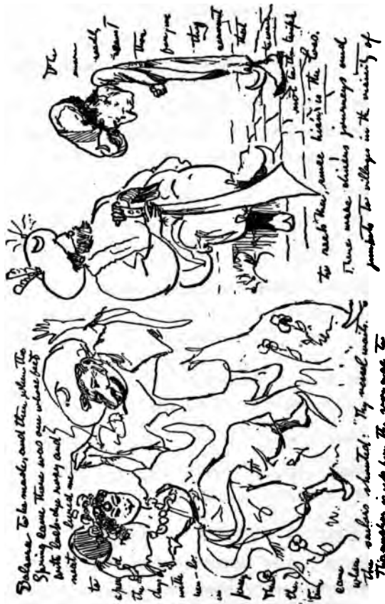
Copyright, 1903, by Parron Publishing Co. Autograph letter of Booth Tarkenton. Showing in reduced facsimile two of his caricatures of himself