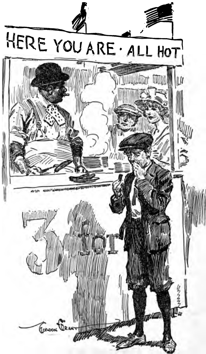
The first bite convinced him that he had made a mistake