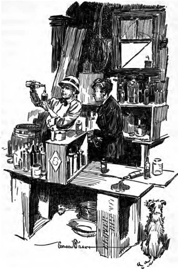
Penrod stopped sales to watch this operation