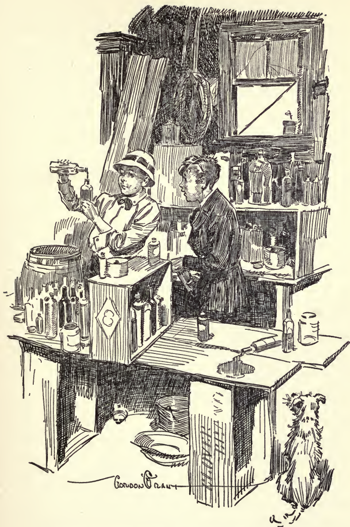
Penrod stopped sales to watch this operation