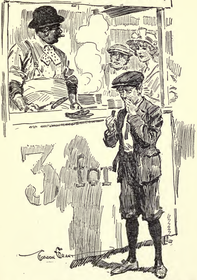
The first bite convinced him that he had made a mistake