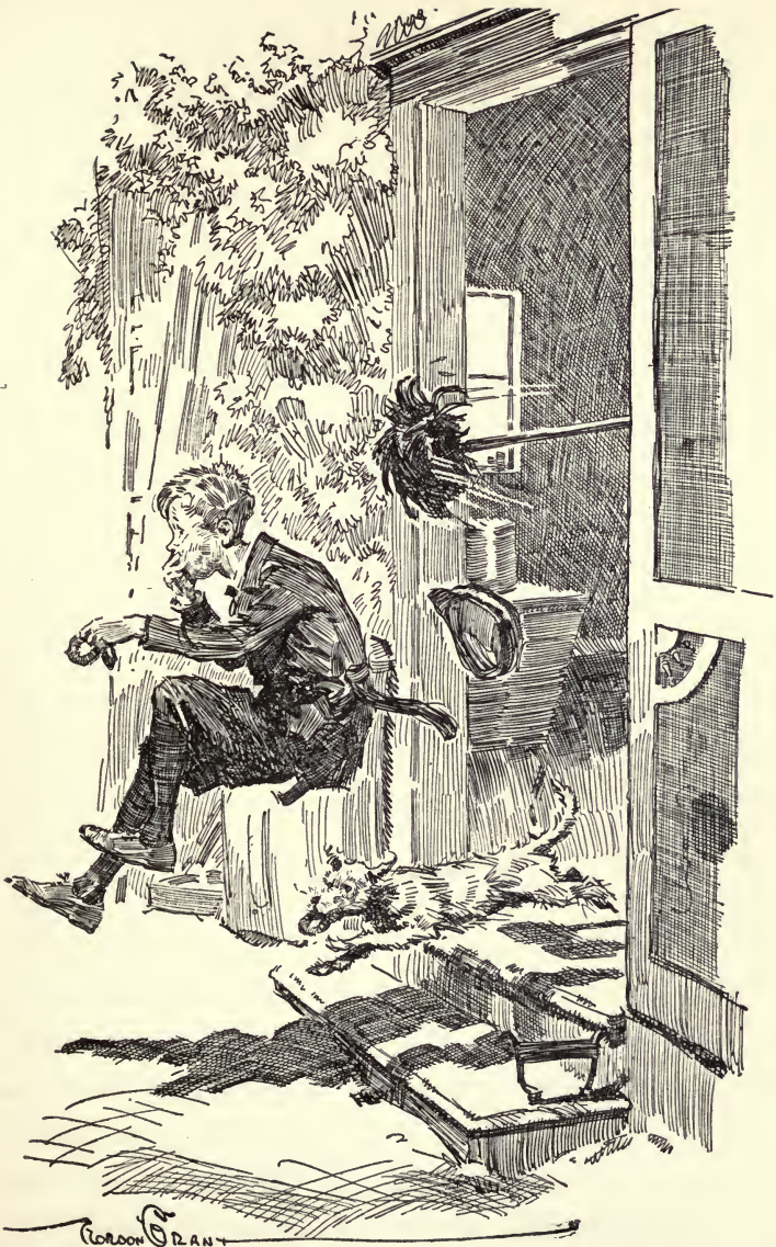
At about ten of the clock Penrod emerged hastily from the kitchen door