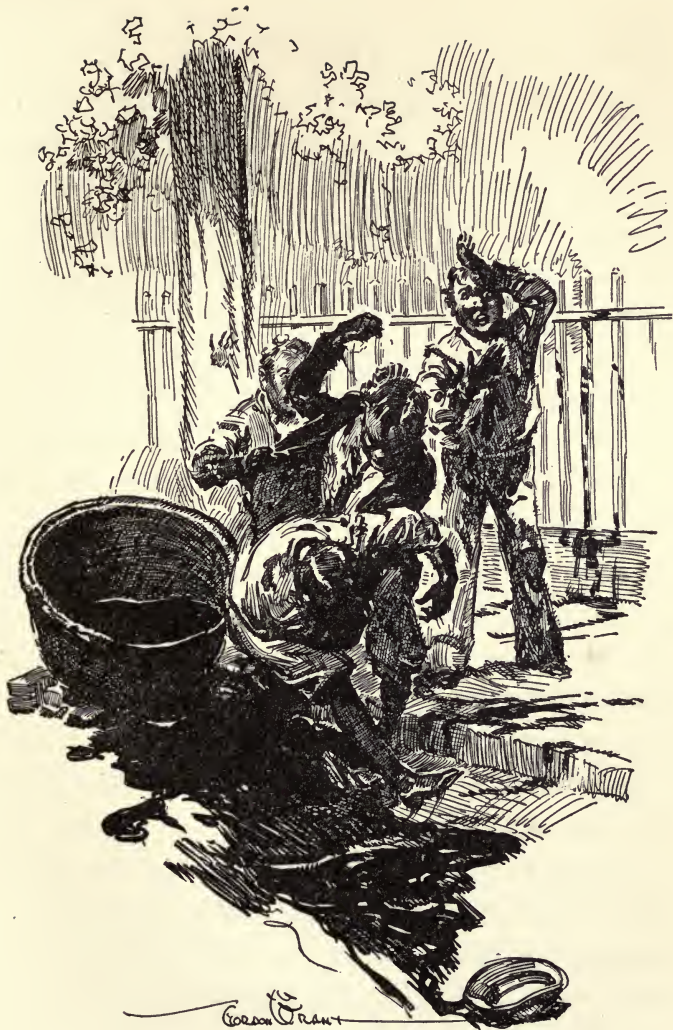
Thus began the Great Tar Fight