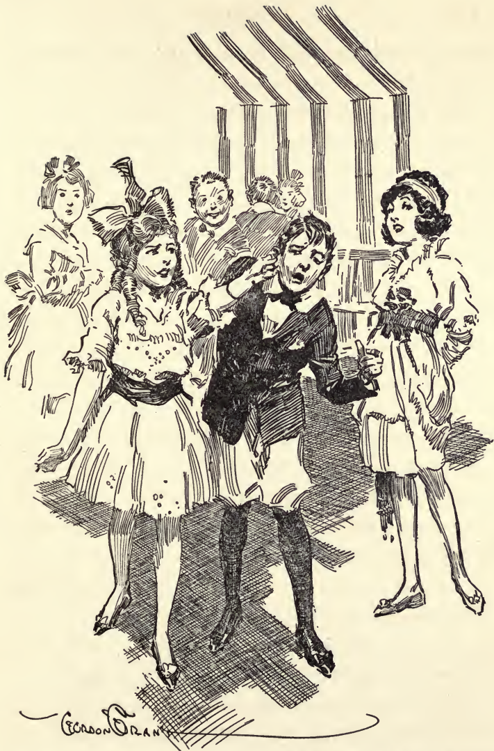
By his ear she swung him away from Fanchon and faced him toward the lawn.