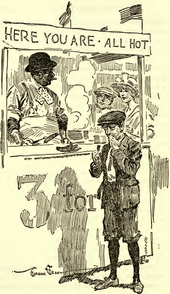
The first bite convinced him that he had made a mistake