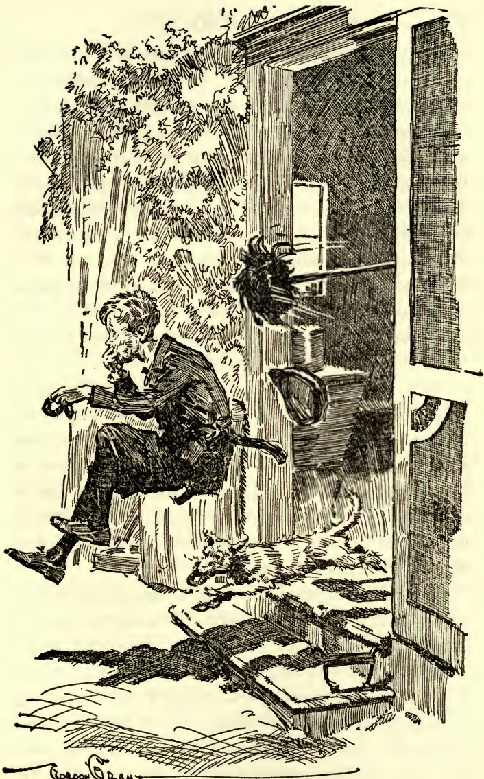
At about ten of the clock Penrod emerged hastily from the kitchen door