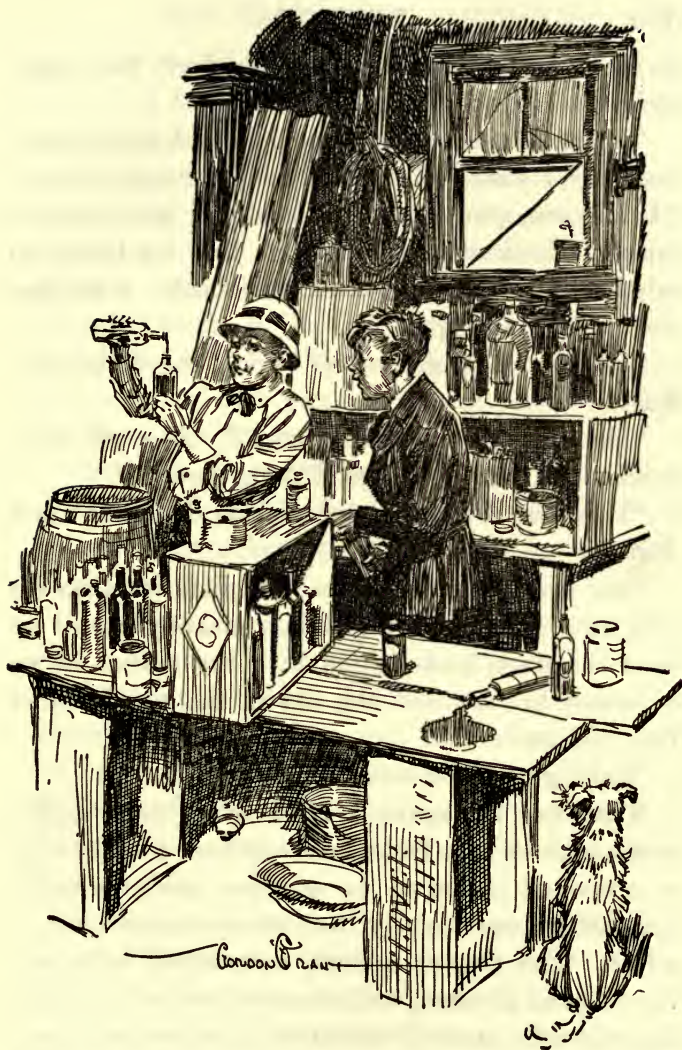
Penrod stopped sales to watch this operation