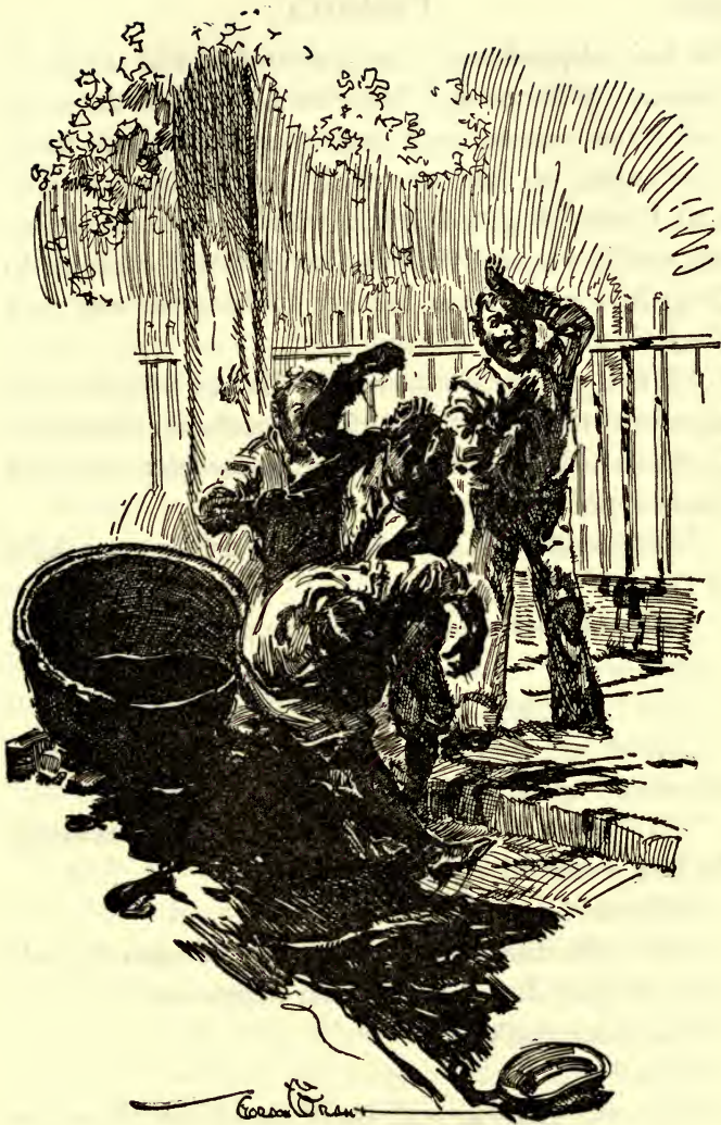
Thus began the Great Tar Fight