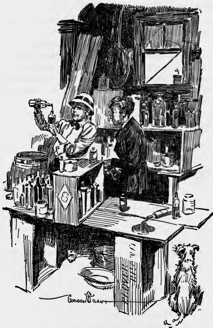
Penrod stopped sales to watch this operation