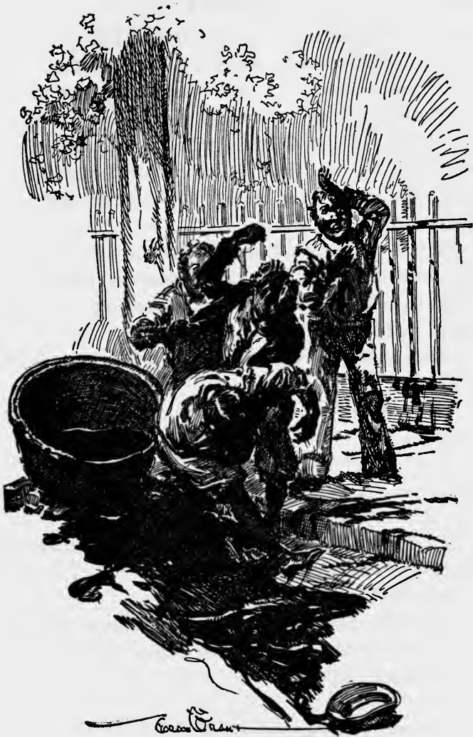
Thus began the Great Tar Fight