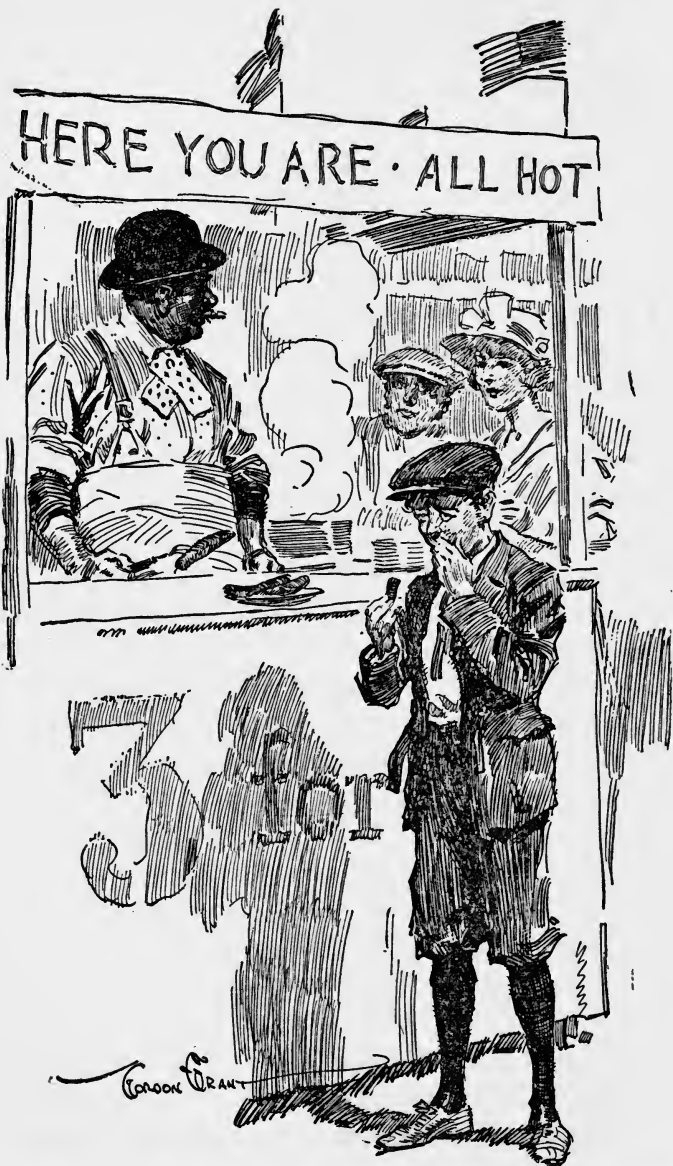
The first bite convinced him that he had made a mistake