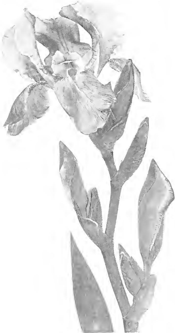
Iris germanica Purple King