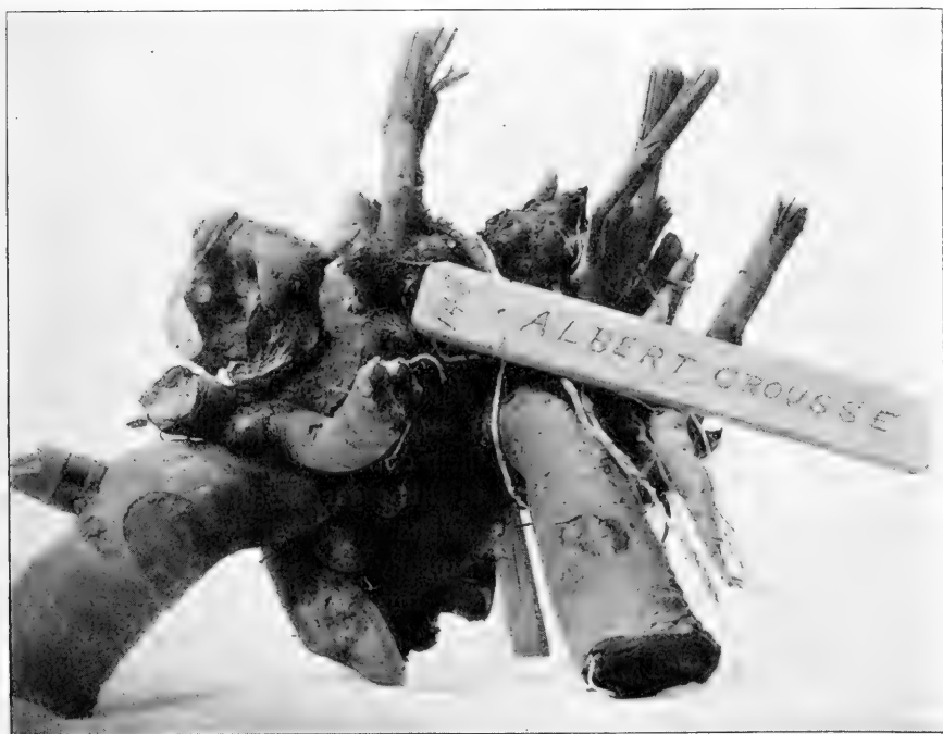
A Better and much more Satisfactory Way of Attaching a Peony Label.

Again, confusion sometimes arises directly in the nursery row itself, and this is often due to the fact that in digging,