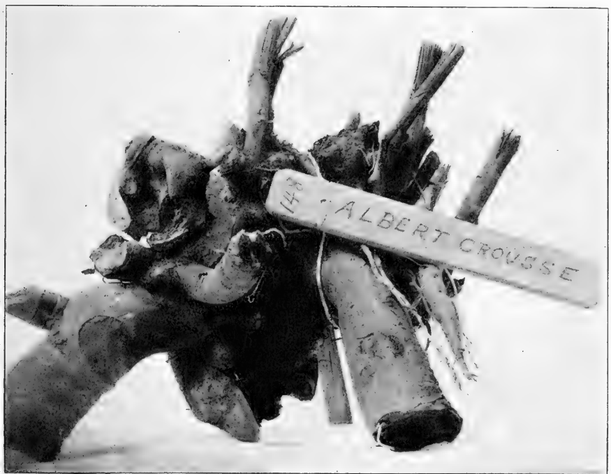
A Better and much more Satisfactory Way of Attaching a Peony Label.

Again, confusion sometimes arises directly in the nursery row itself, and this is often due to the fact that in digging,