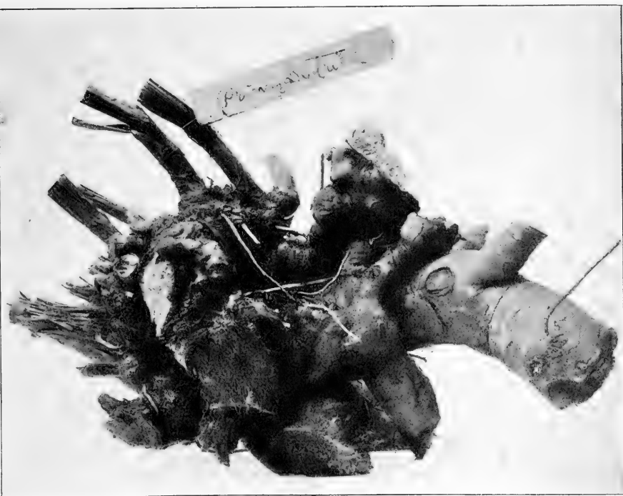
One of the Poorest, yet a Common Method of Attaching a Peony Label.

In general, catalogues not bearing date of publication were not considered. In some cases the dates were secured through