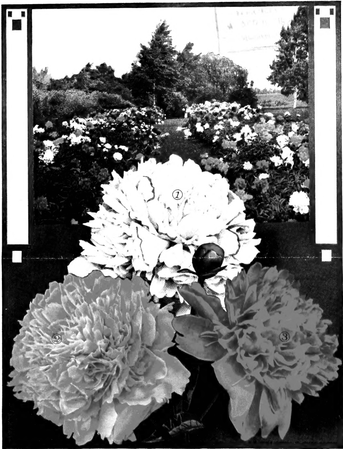
PERRY NURSERY COMPANY Dependable Fruit and Ornamental Trees and Plants ROCHESTER, N. Y. "The Flower City"