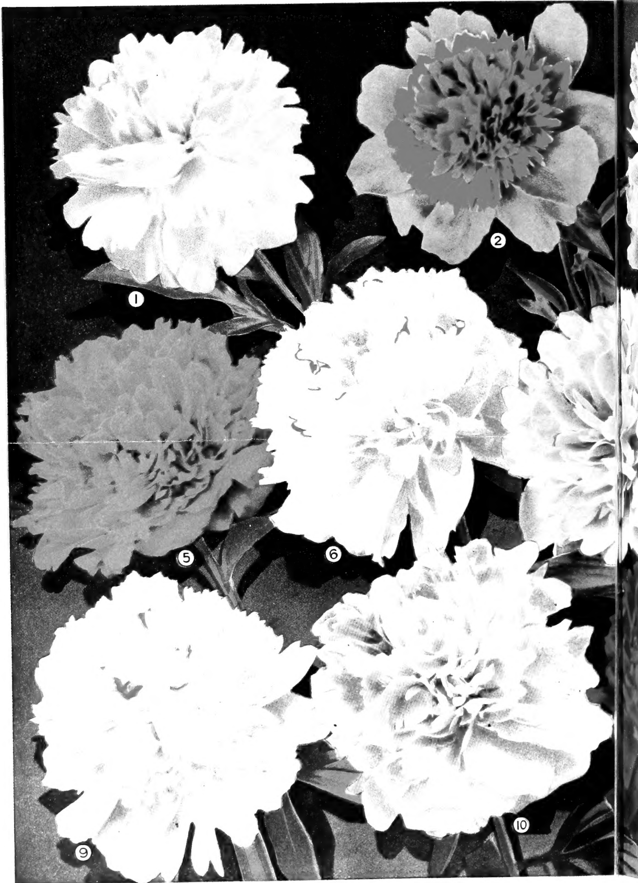
1 Grandiflora Rosa 2 Mme. Rose Rendatler 3 Couronne d'Or 4 Delachei 5 Edulis Superba 6 Festiva Maxima 7 or Tre

The Entire Group of Twelve Named for $16.00 -A