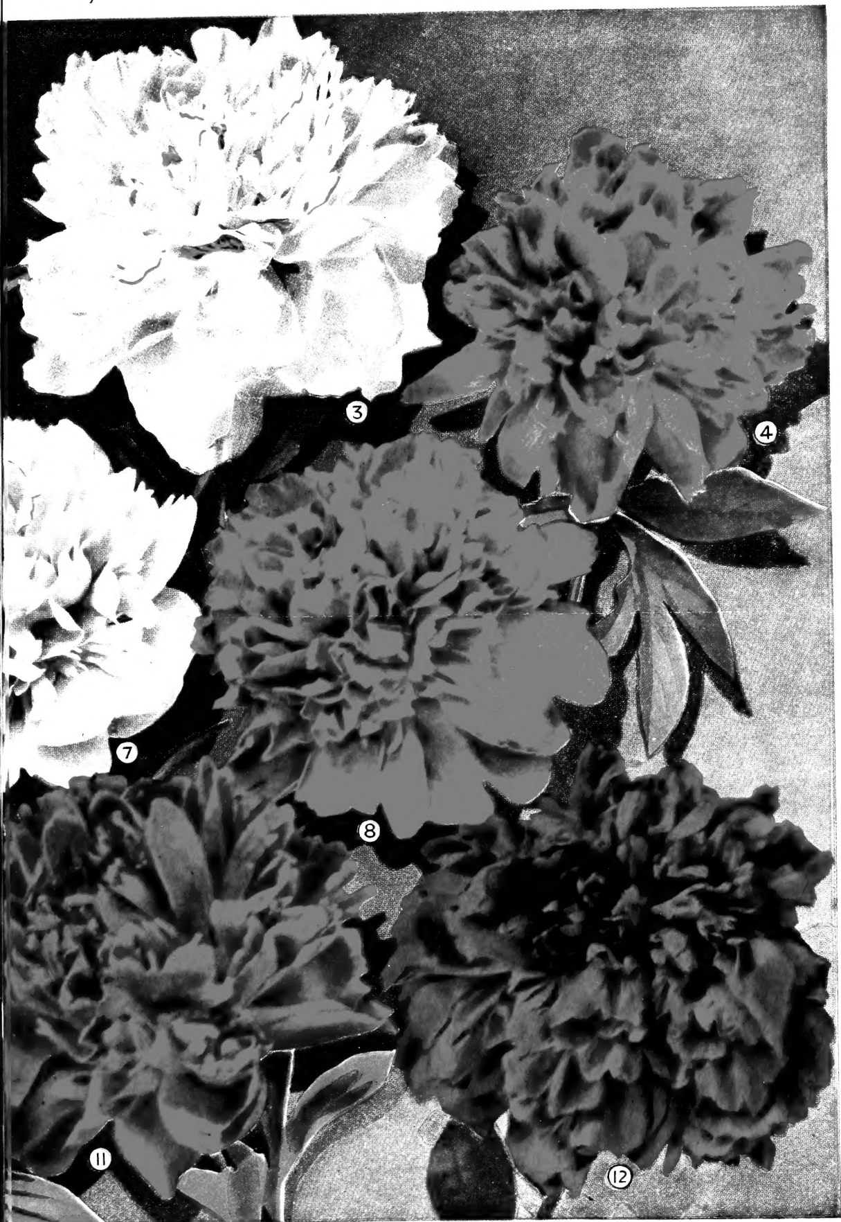
al Treasure 8 Louis Van Houtte 9 Mme. Crousse 10 Duchesse de Nemours 11 Francois Ortegat 12 Prince Imperial