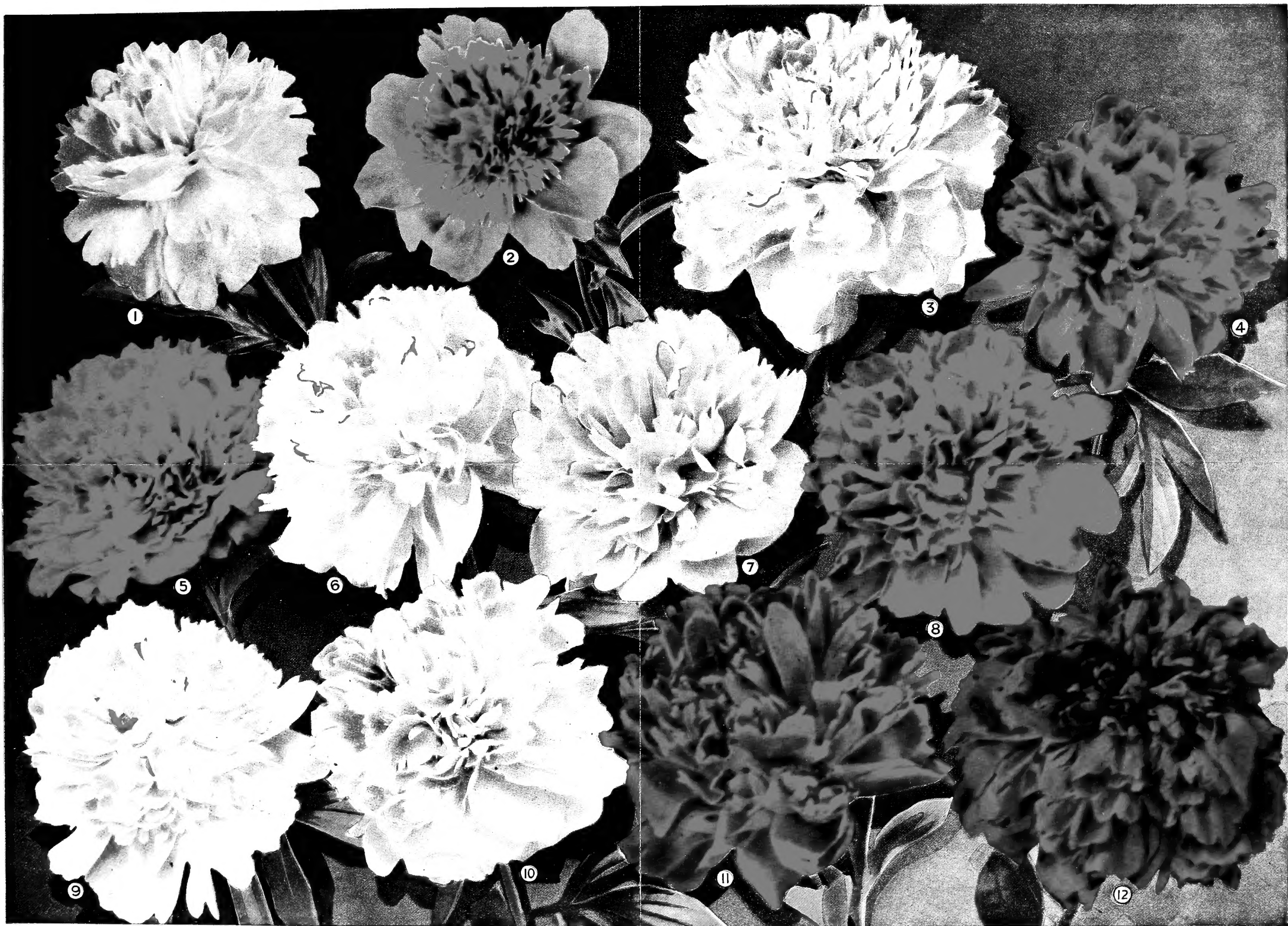
1 Grandiflora Rosea 2 Mme. Rose Rendatler 3 Couronne d'Or 4 Delachei 5 Edulis Superba 6 Festiva Maxima 7 Floral Treasure 8 Louis Van Houtte 9 Mme. Crousse 10 Duchesse de Nemours 11 Francois Ortegat 12 Prince Imperial

The Entire Group of Twelve Named for $16.00—Any Six for $8.50—Any Three for $4.50