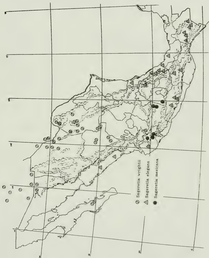
Map 1. Geographic distribution of Sageretia species in México and adjacent southwestern United States. The range of S. elegans continues southward into Central and South America.