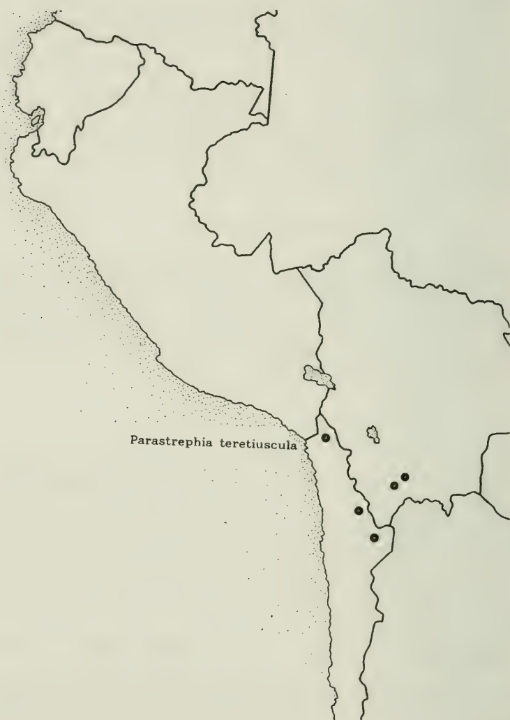
Map 3. Distribution of Parastrephia teretiuscula .