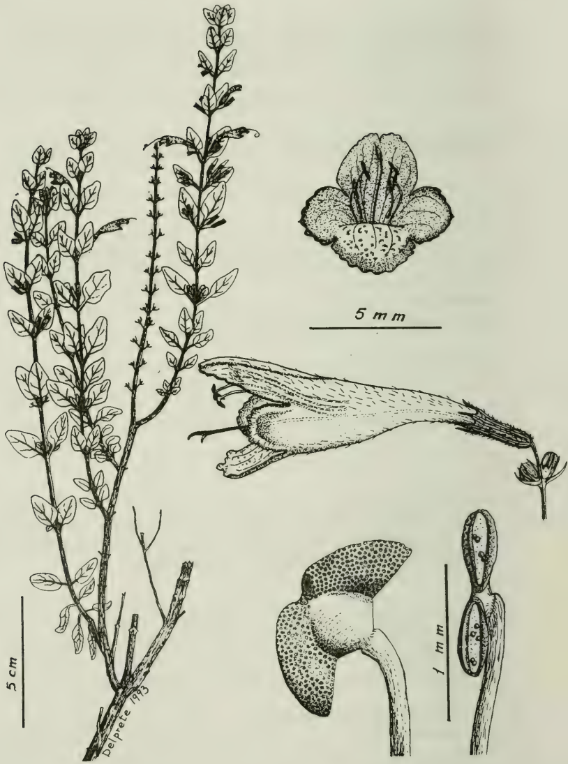
Figure 1. Satureja hintoniorum , from holotype.