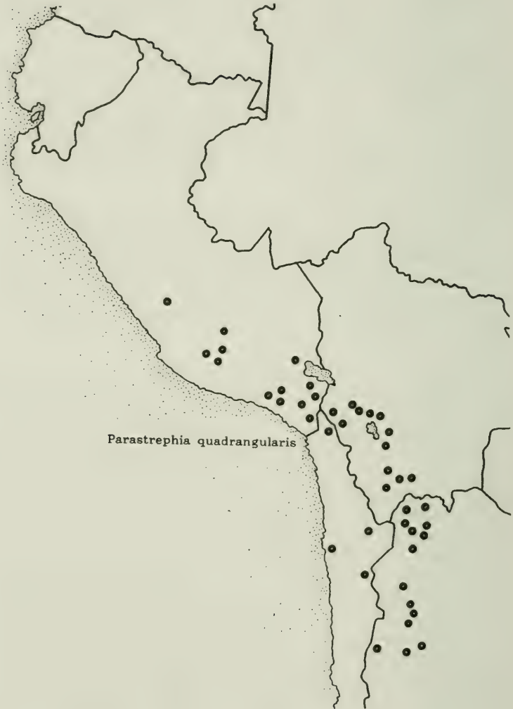
Map 2. Distribution of Parastrephia quadrangularis .