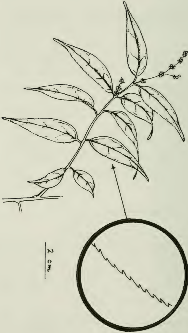
Figure 1. Habit illustration of Sageretia mexicana .