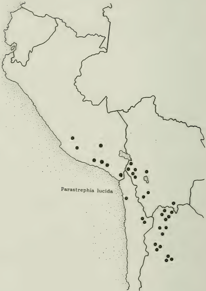
Map 1. Distribution of Parastrephia lucida .