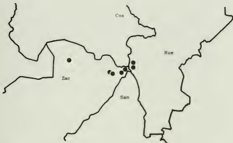
Map 1. Geographic distribution of Desmodium subrosum .

occur in the region of Novo-Galiciana and are treated in detail by McVaugh (1987), these marked with an asterisk in the following account. Six of these species also have been included by Estrada & Marroquin (1992) in their account of Fabaceae from south-central Nuevo León.