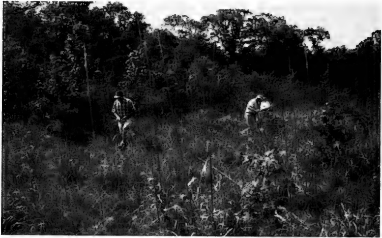
Figure 5. Eriocaulon koernickianum habitat at Arc Ridge Ranch, Van Zandt County.

than it was in 1999. Clearly, it was once a viable bog; it is now severely degraded.