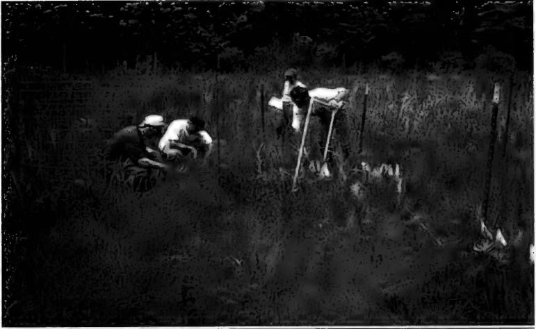
Figure 3. Eriocaulon koernickianum habitat at Andrew's Bog, Gus Engeling Wildlife Management Area, Anderson County.

Andrew's Bog (EOCODE PMERI01040*003*TX) (EOCODE records refer to Texas Parks and Wildlife records). Vouchers have been collected since 1990 from several locations on the northern shore of this bog (see Tables 1, 2, and 3 for further information about all sites where E. koernickianum is found).