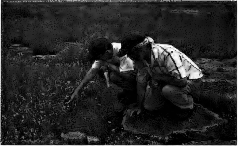
Figure 4. Eriocaulon koernickianum habitat at Enchanted Rock, Gillespie County. Flowers are Utricularia cornuta .

GILLESPIE CO.; Enchanted Rock . This site is on the south side of Enchanted Rock State Natural Area (Texas Parks and Wildlife)(Figure 4) and is the only known site for this species in the Edwards Plateau.