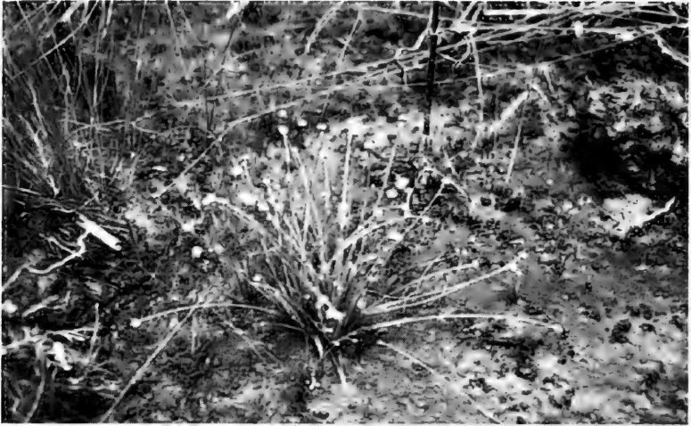
Figure 1. Eriocaulon koernickianum from Andrew's Bog, Gus Engeling Wildlife Management Area, Anderson County.