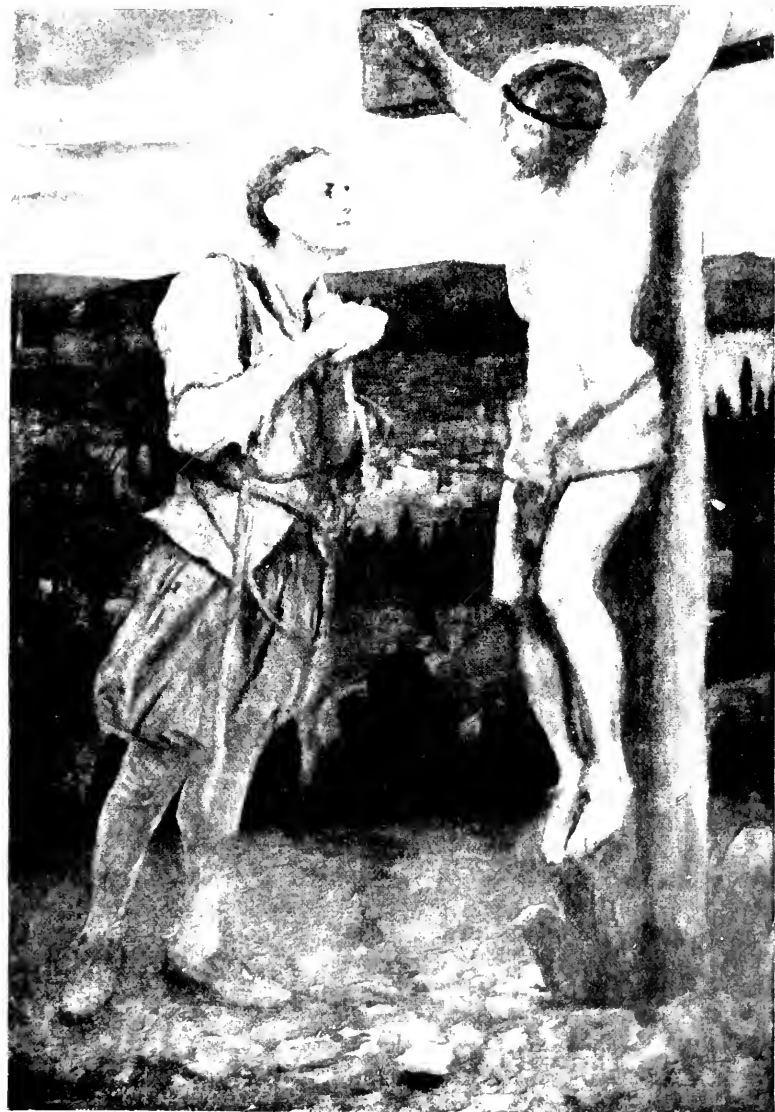
THE CRUCIFIXION. (Detail from the fresco in the Sistine Chapel, Rome.)