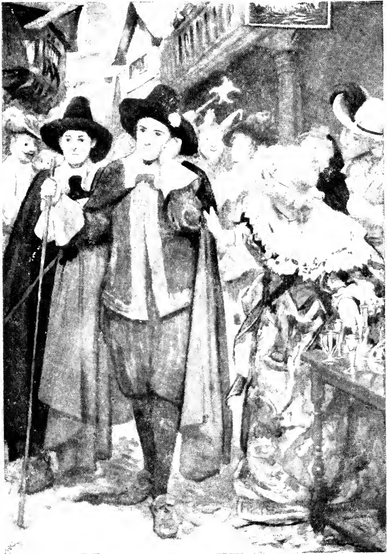
CHRISTIAN AND FAITHFUL IN VANITY FAIR.