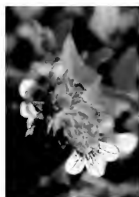
left - P. rydbergii right - P. deustus