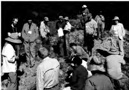
American Penstemon Society