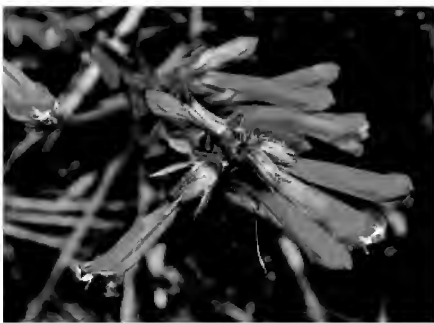
P. newberryi