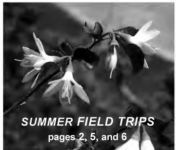
Styx redivivus , Nomlaki Trail II, April 24, 2016 by Woody Elliott

Saving our precious and endangered natural environment requires legislators who regard conservation as a priority, not something to be attended to when it is politically convenient. Your vote will help.